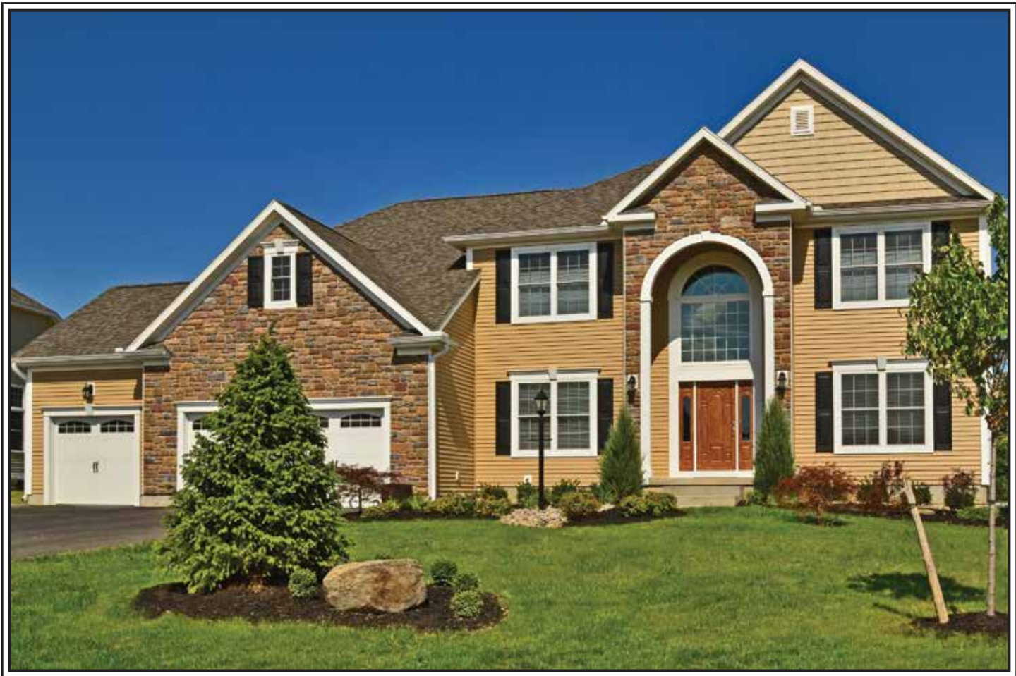
Country Manor elevation shown with front-load 3-car garage.