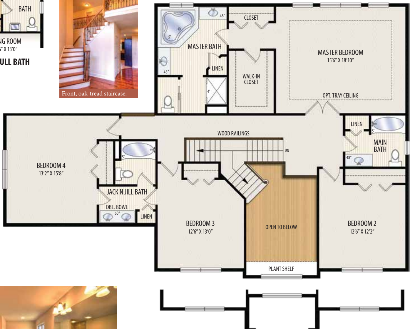
COUNTRY MANOR ELEVATION