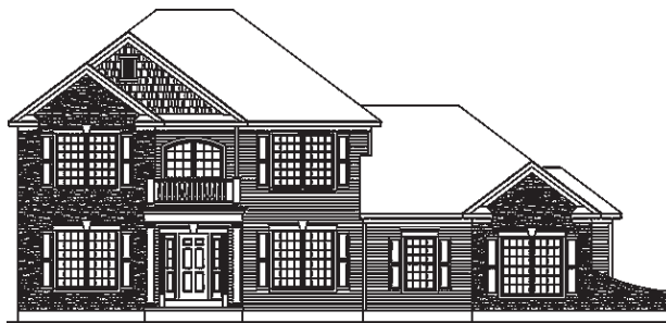
Town & Country