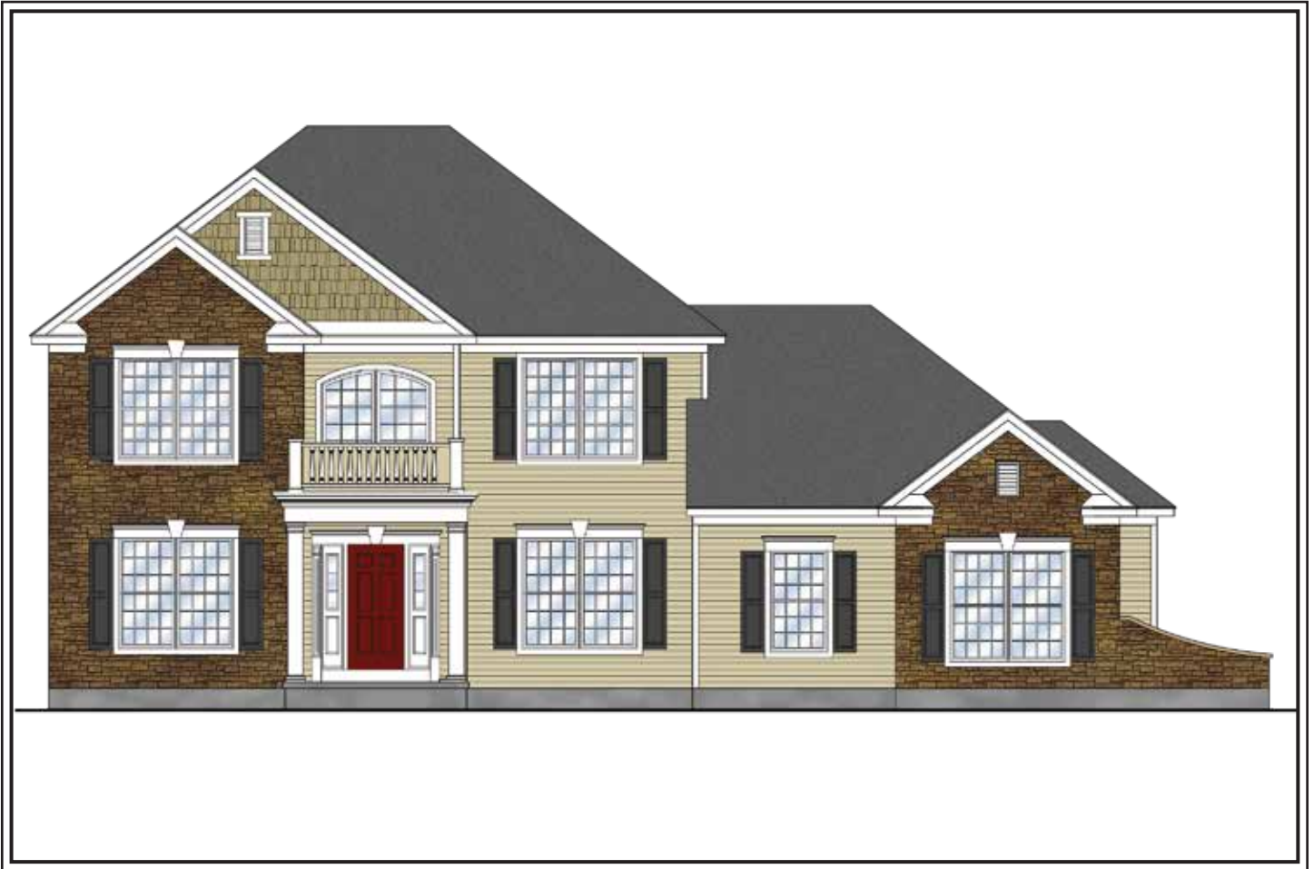
Town & Country elevation shown with side-load garage.