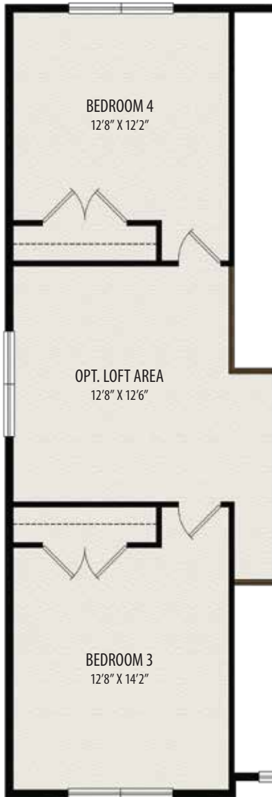
OPT. LOFT AREA Additional 177 sq. ft.