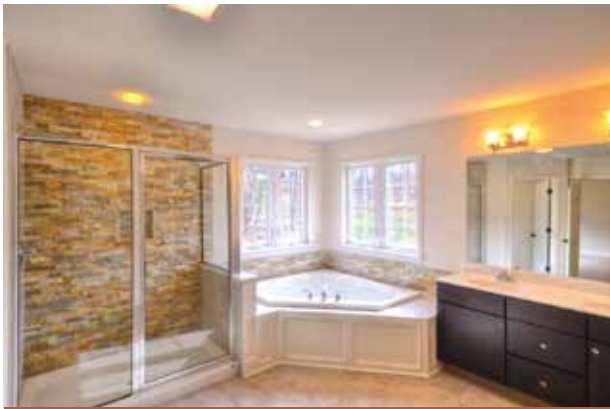
Master bathroom with corner jetted-tub and tiled shower.