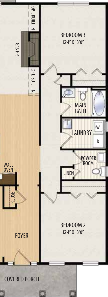
& COUNTRY ELEVATION