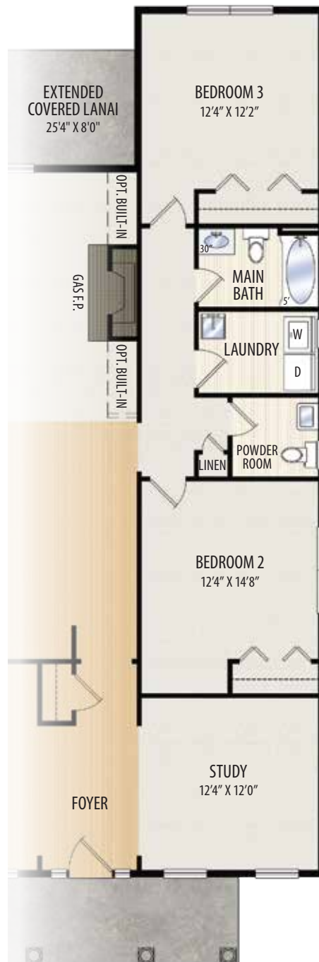
OPT. STUDY Additional 145 sq.ft.