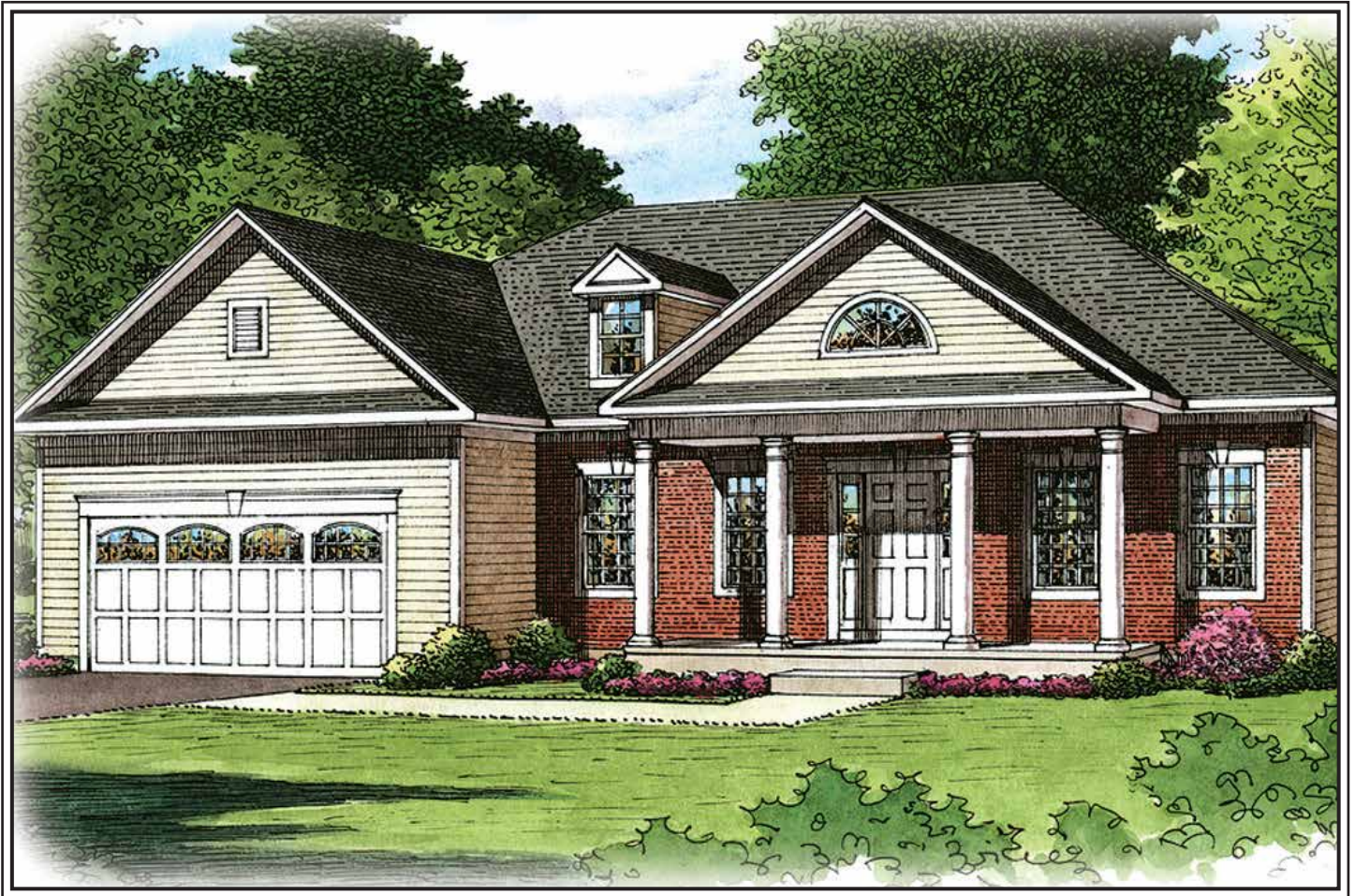
Town & Country elevation shown with front-load garage.