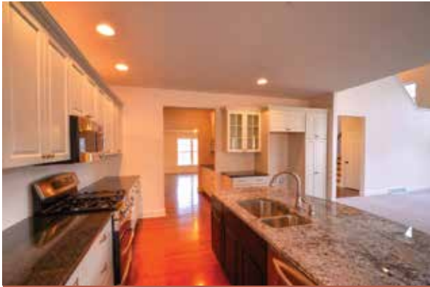
Kitchen showing center island overlooking main living area.

1 Story • 2,535 sq.ft. • 3 Bedrooms • 2.5 Baths • Dining Room • Opt. Study • Covered Lanai • 3-Car Sideload Garage