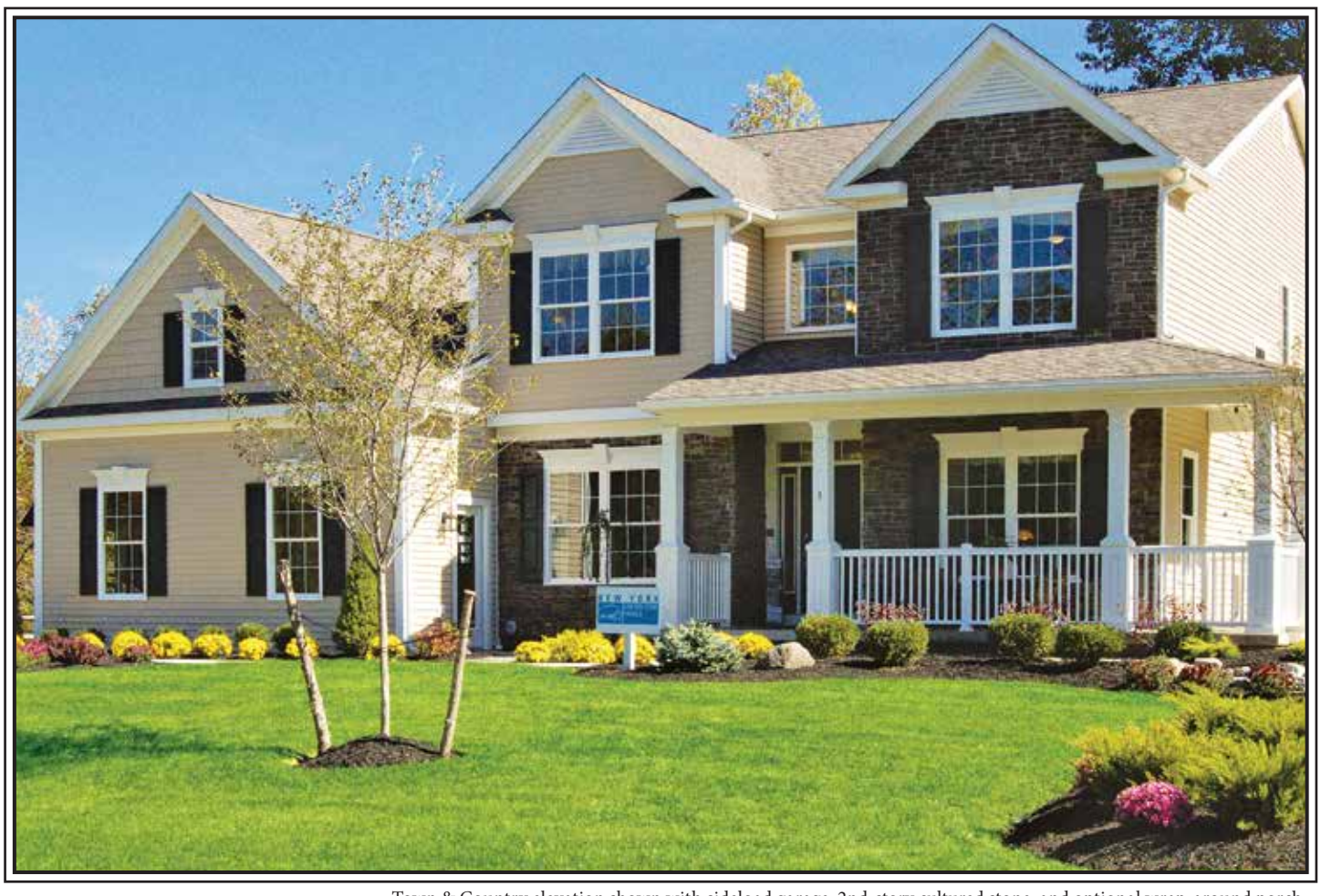
Town & Country elevation shown with sideload garage, 2nd-story cultured stone, and optional wrap-around porch.