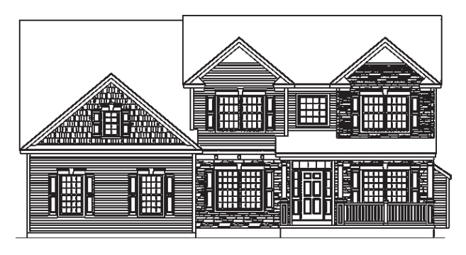
Town & Country Shown with optional 2nd-story cultured stone.