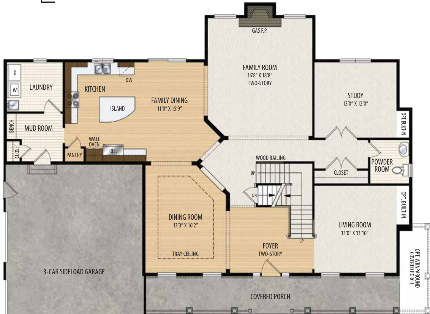
COUNTRY MANOR ELEVATION