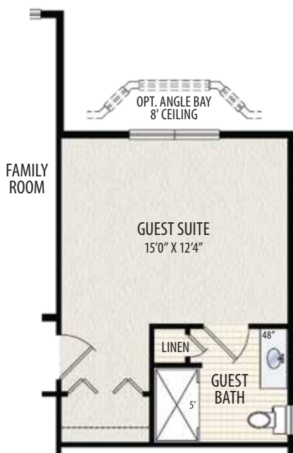
OPT. GUEST SUITE