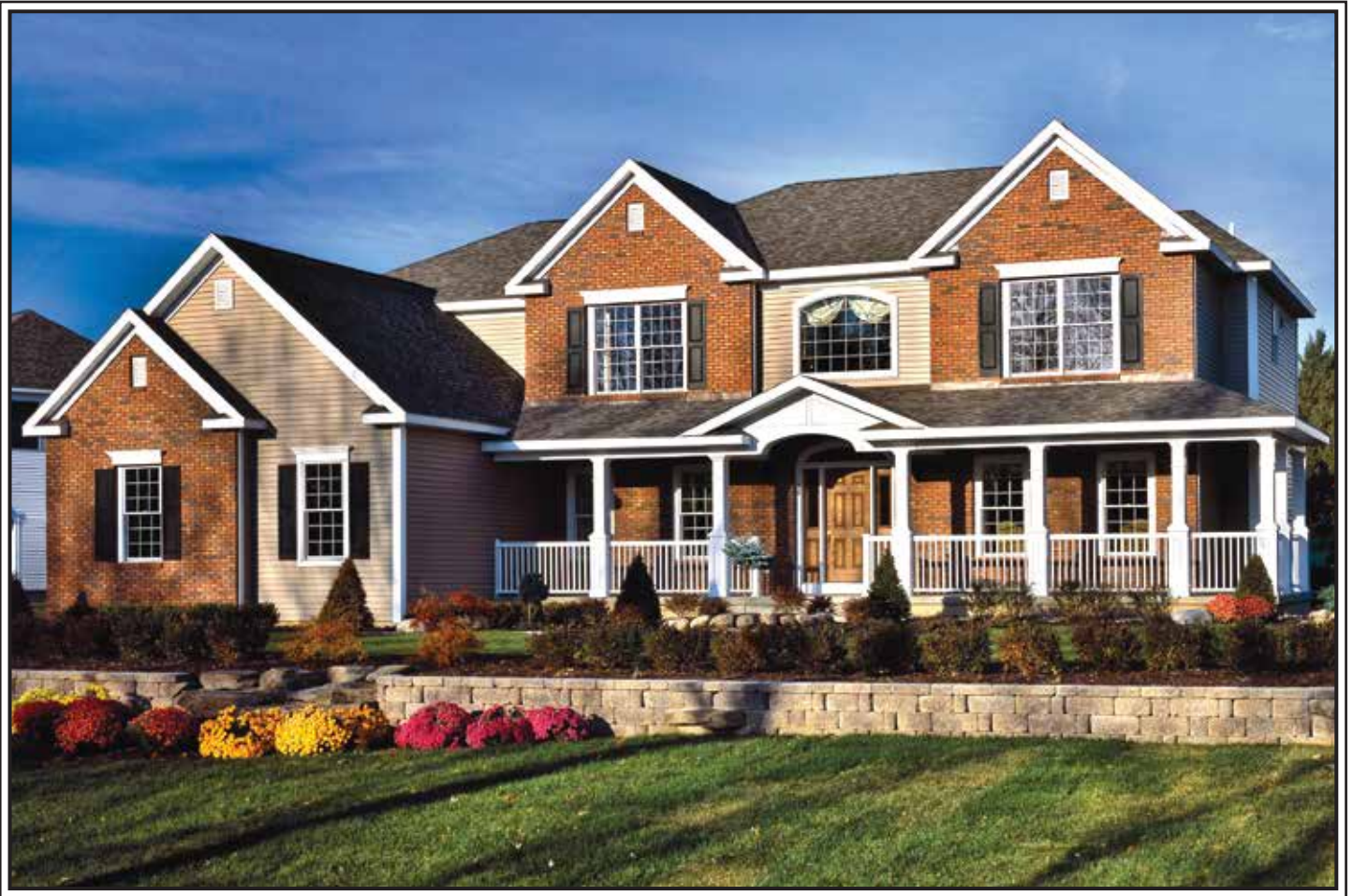
Country Manor elevation shown with optional wraparound porch and sideload 3-car garage.