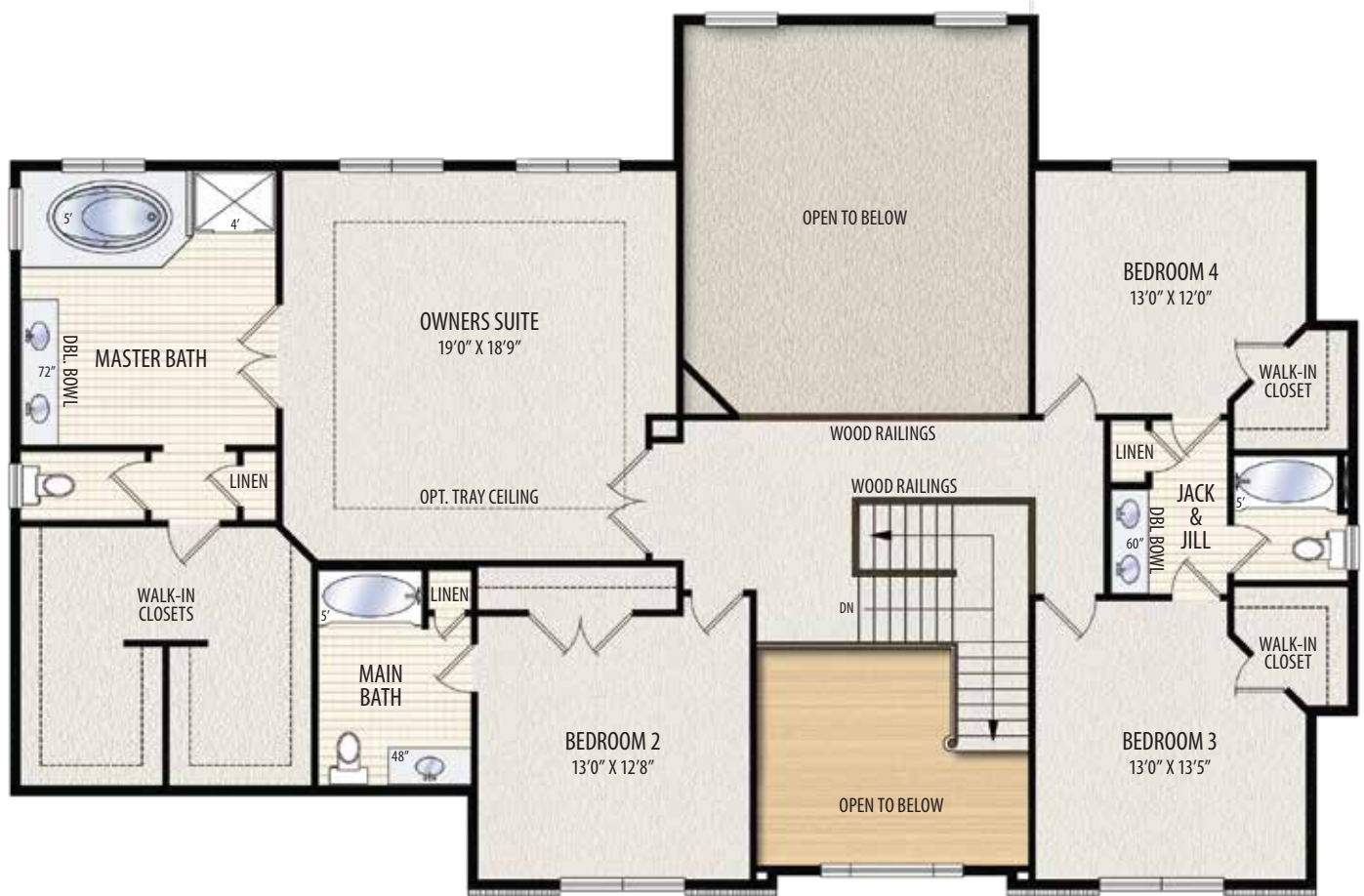
COUNTRY MANOR ELEVATION