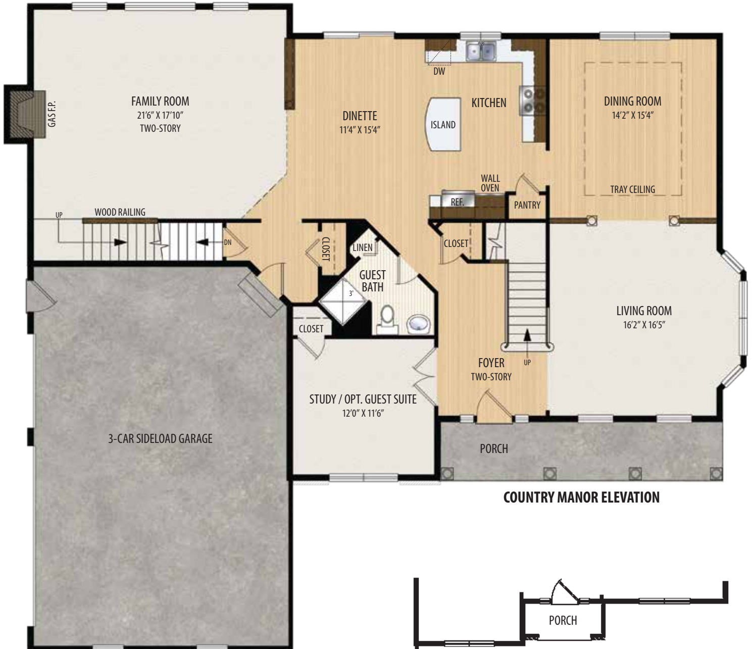
COUNTRY MANOR ELEVATION