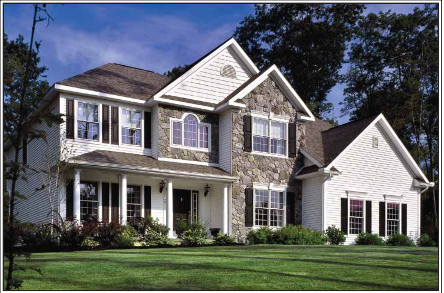
Country Manor elevation shown with side-load garage.