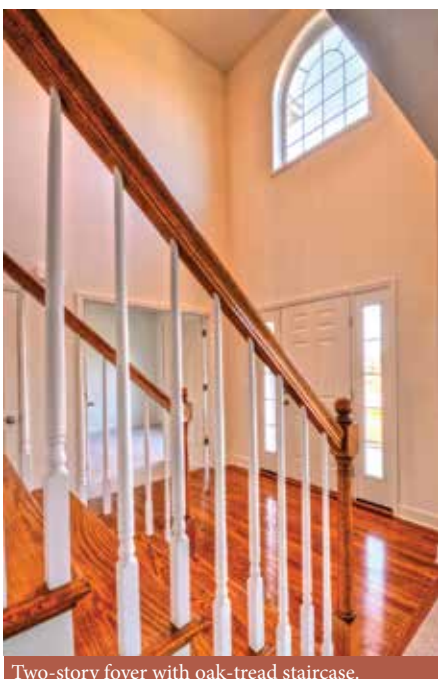
Two-story foyer with oak-tread staircase.