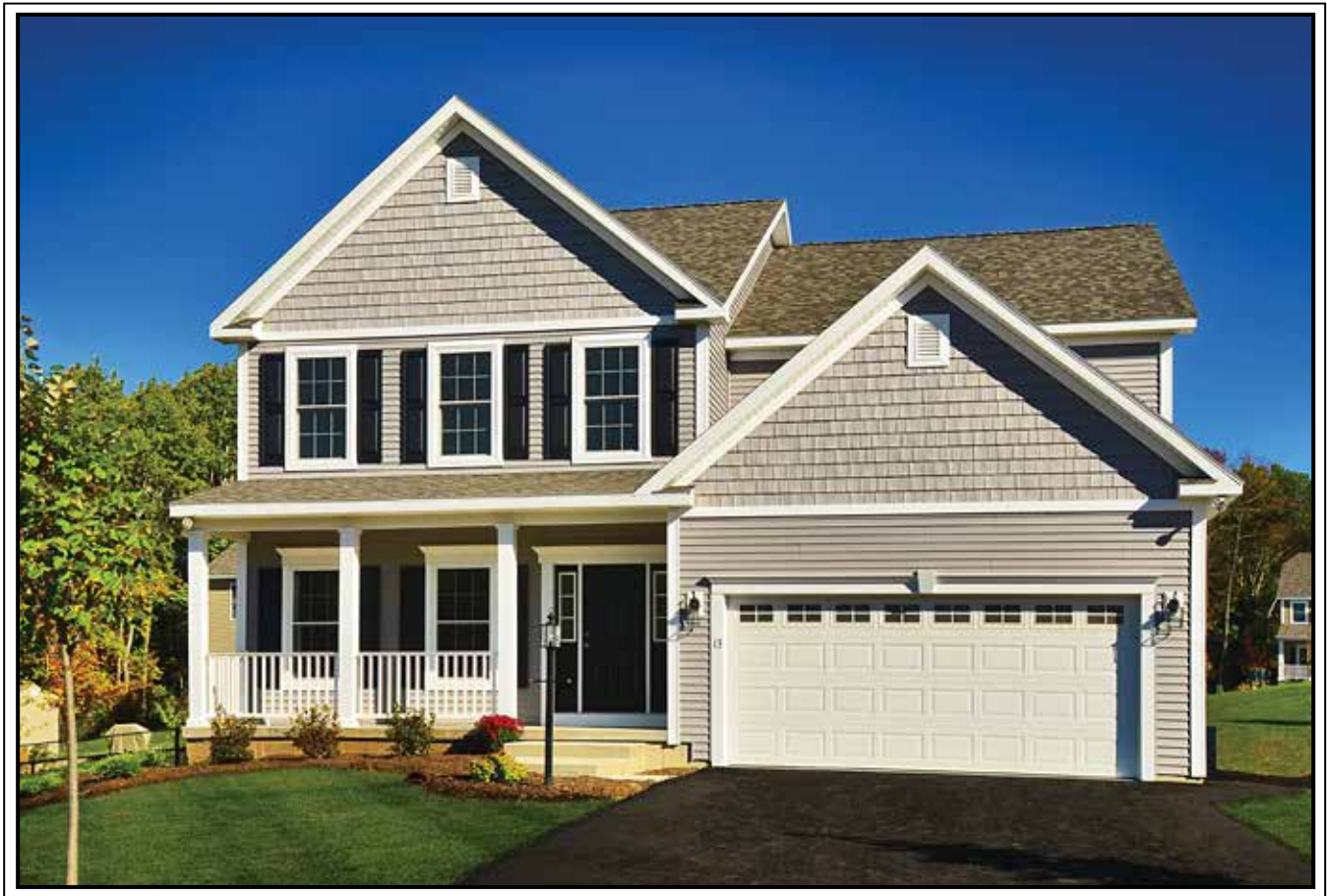
AMERICAN FARMHOUSE elevation.