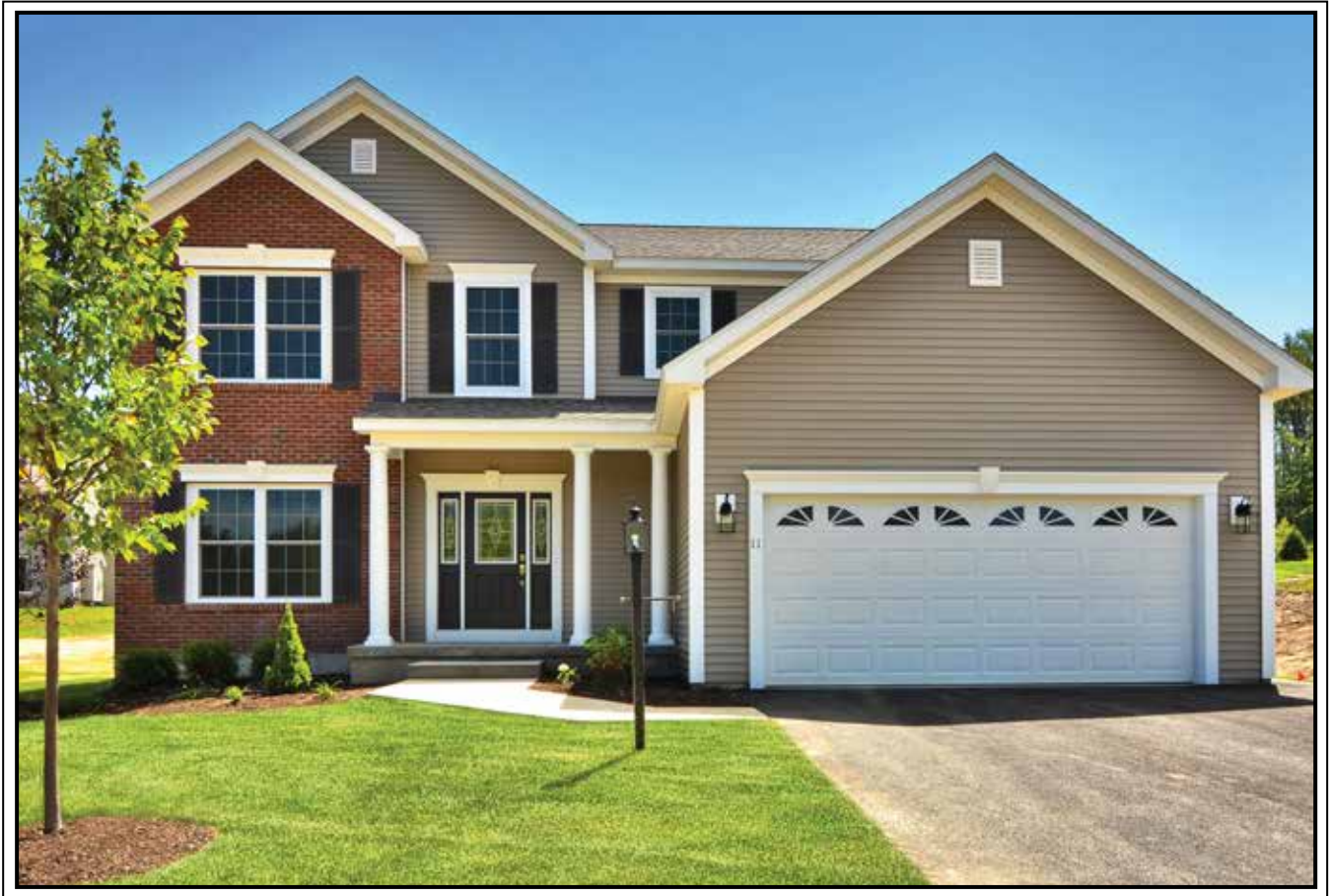
COUNTRY MANOR elevation shown with optional brick.