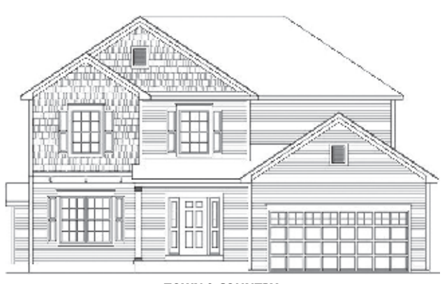
TOWN & COUNTRY