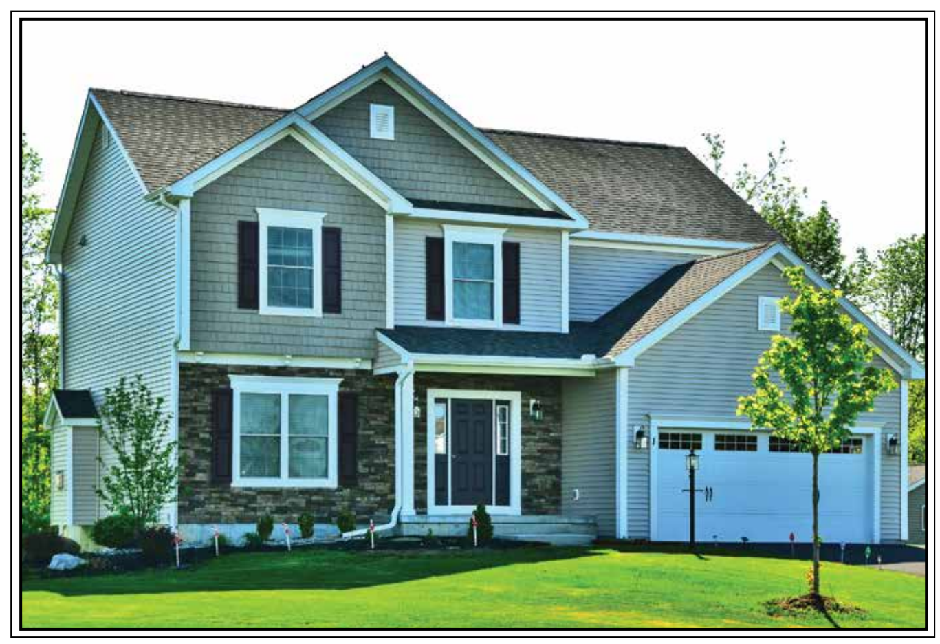
AMERICAN FARMHOUSE elevation shown with optional stone.