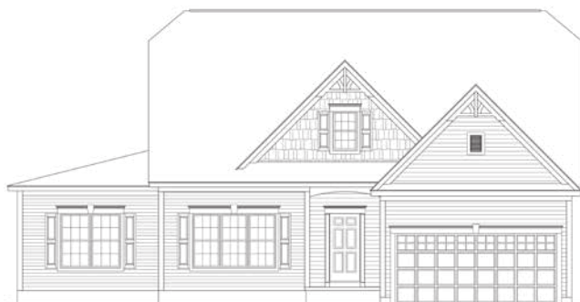
TOWN & COUNTRY