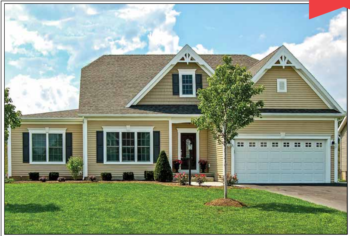
TOWN & COUNTRY elevation shown with private Multi-Gen suite.