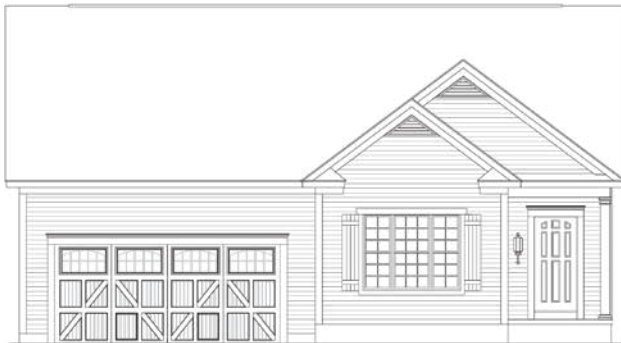
AMERICAN FARMHOUSE 1-Story Elevation.