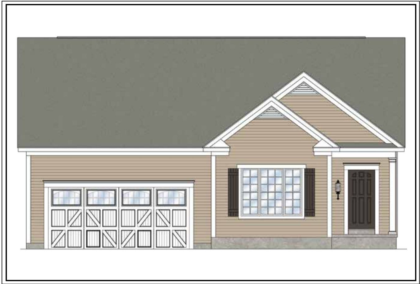
AMERICAN FARMHOUSE 1-Story Elevation.

1 Story, 1,550 sq.ft. or 1.5 Story, 2,062 sq.ft.