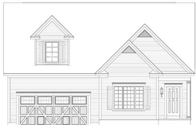
AMERICAN FARMHOUSE 1.5-Story Elevation.