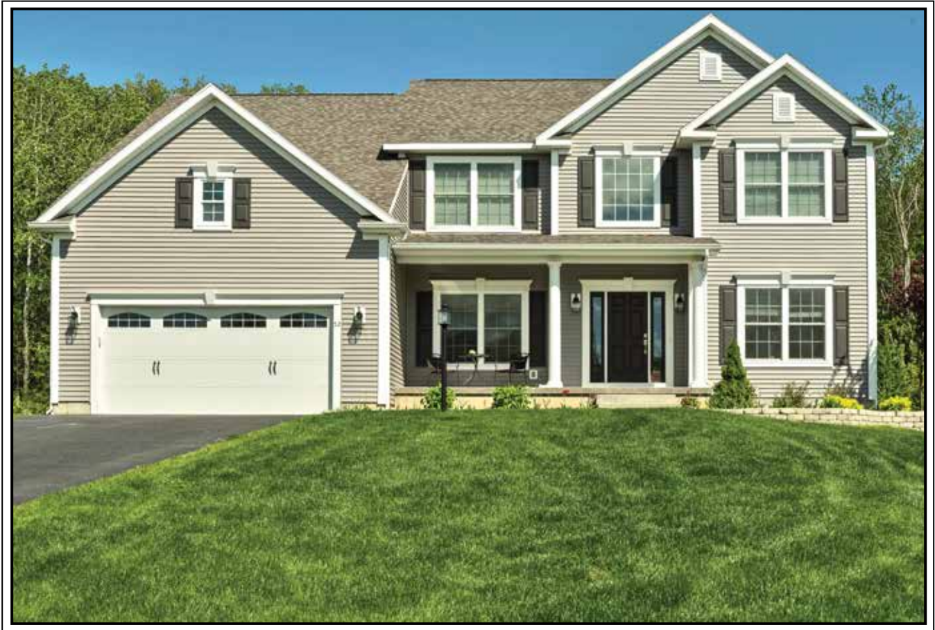
TOWN & COUNTRY elevation shown with optional extended porch.