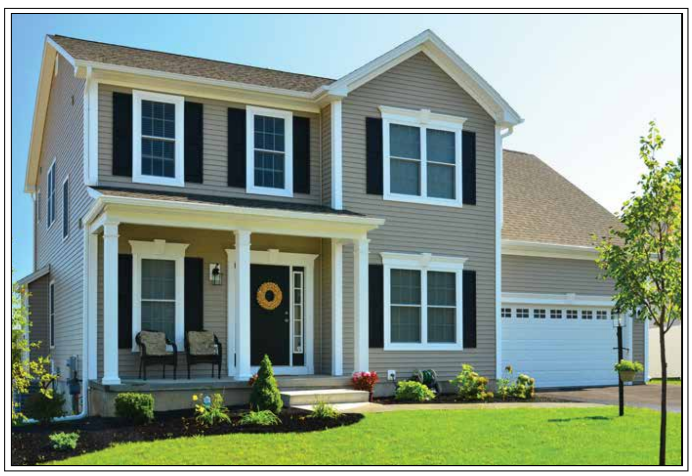
AMERICAN FARMHOUSE elevation.