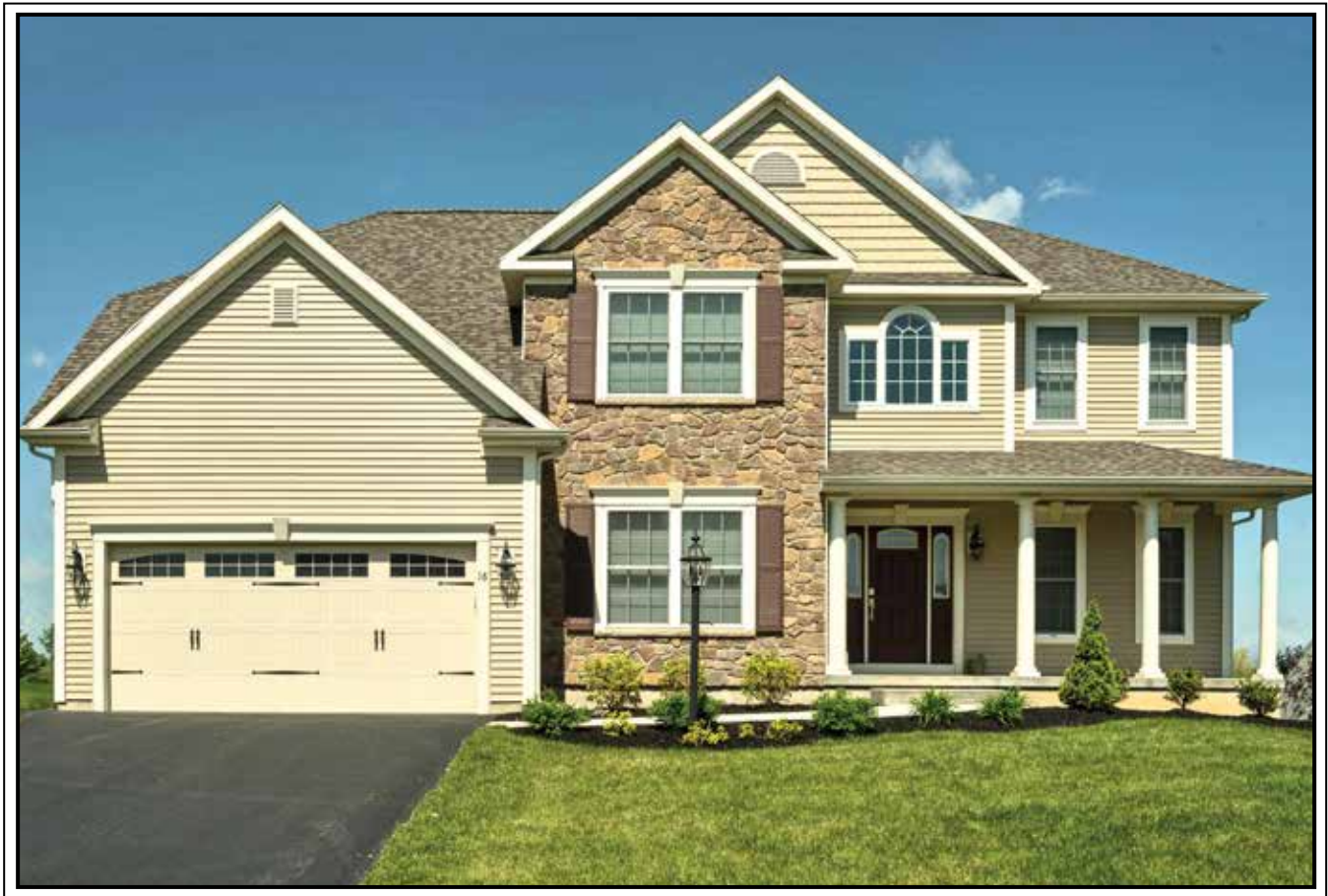
COUNTRY MANOR elevation shown with optional cultured stone.