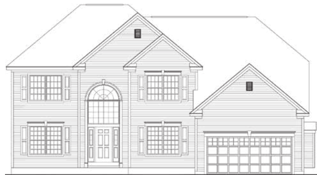
TOWN & COUNTRY