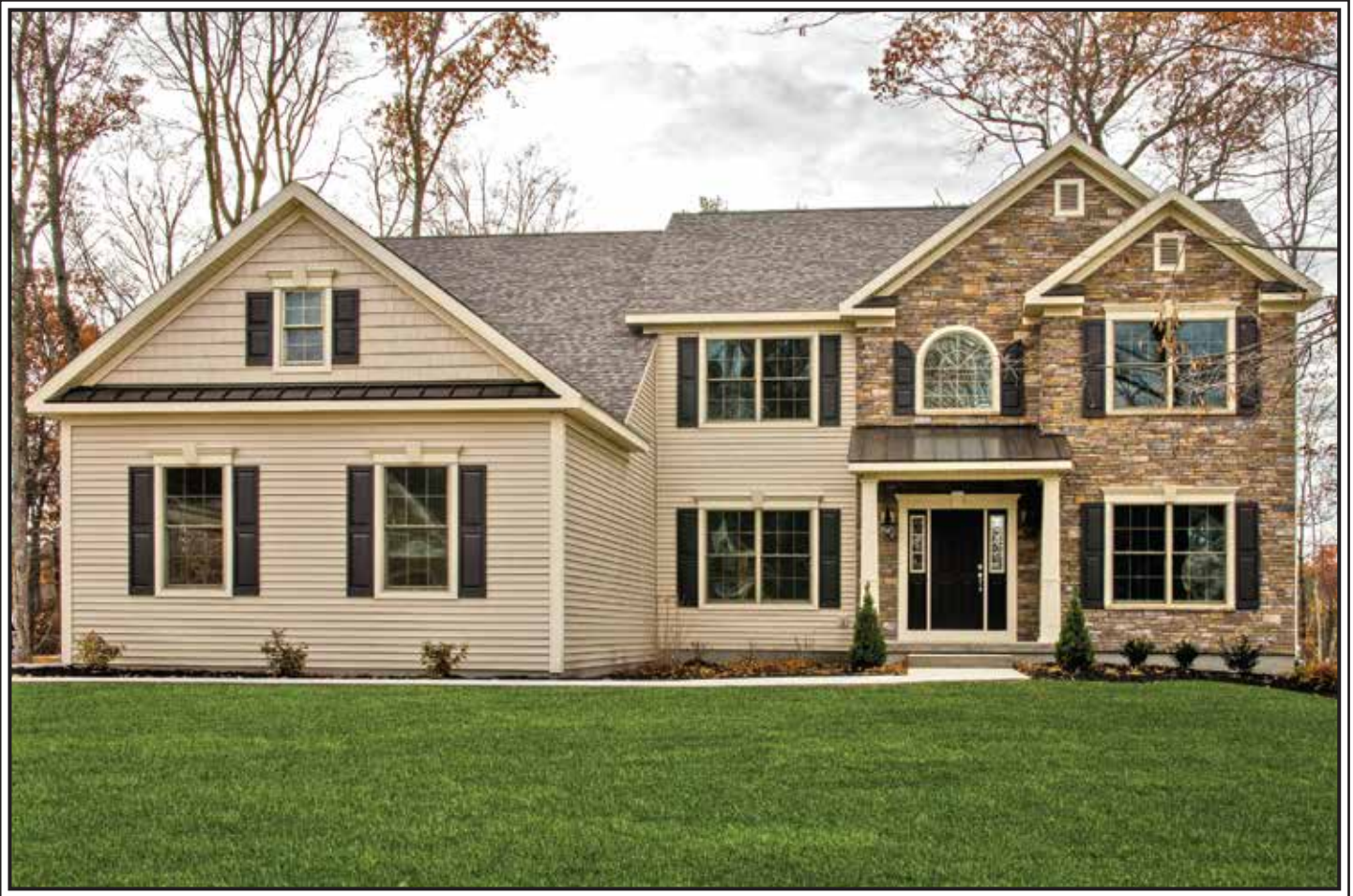
Town & Country elevation shown with optional cultured stone above and around front entrance, and optional arched window.