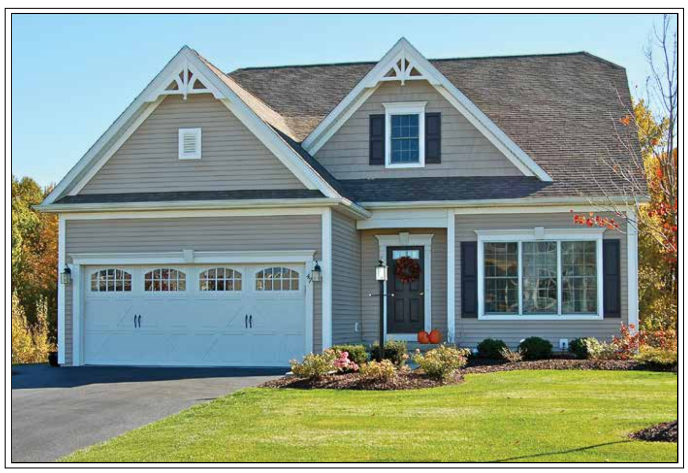
TOWN & COUNTRY elevation.