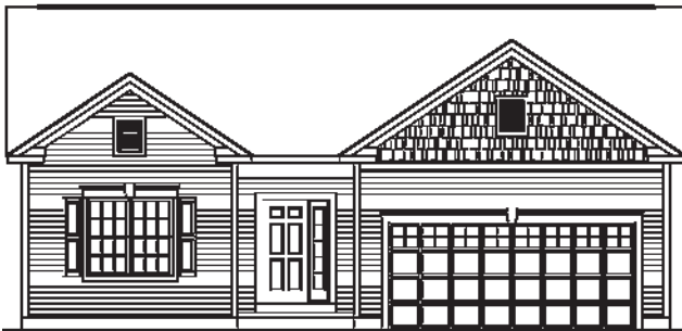
TOWN & COUNTRY