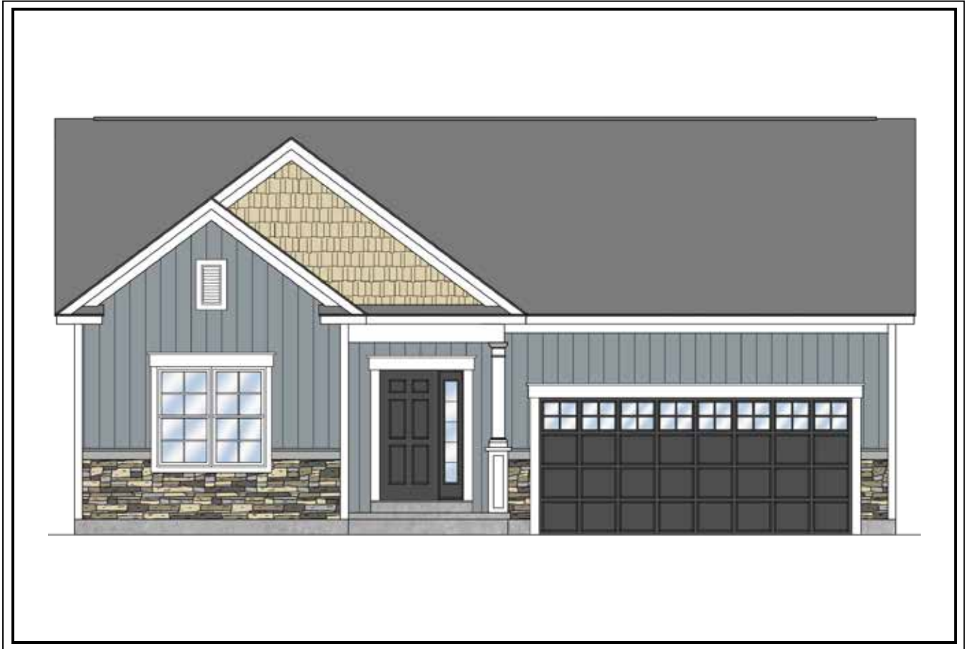
AMERICAN FARMHOUSE elevation shown with optional cultured stone.