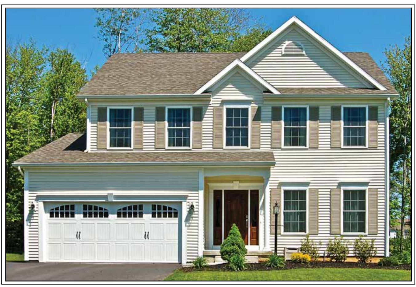
COUNTRY MANOR elevation.