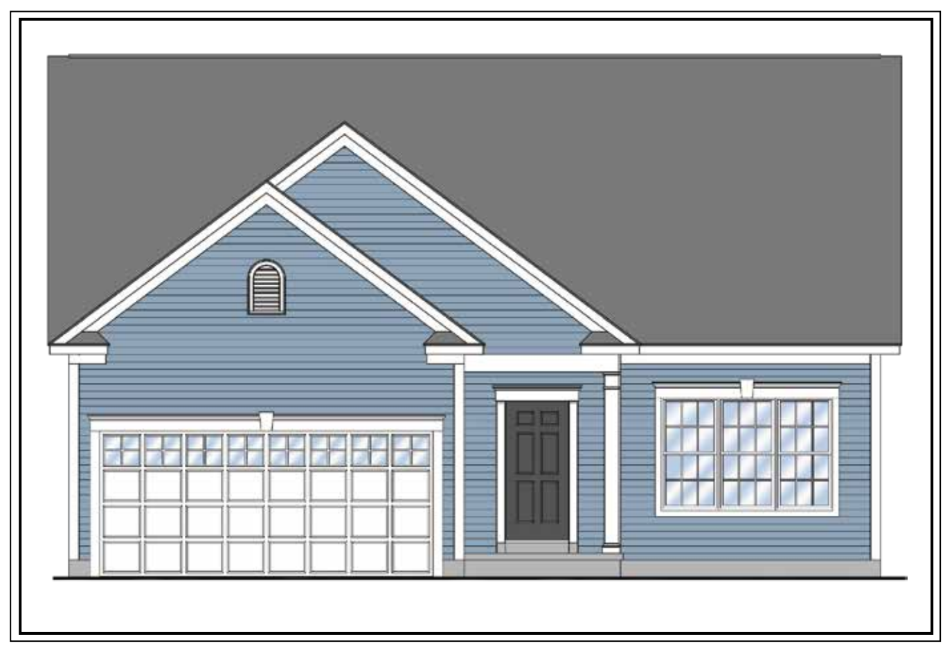
AMERICAN FARMHOUSE elevation.