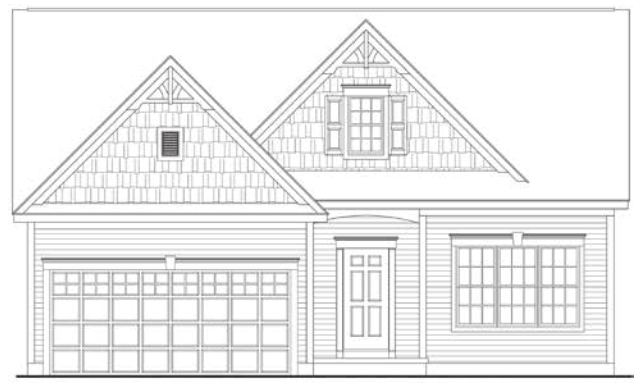
TOWN & COUNTRY