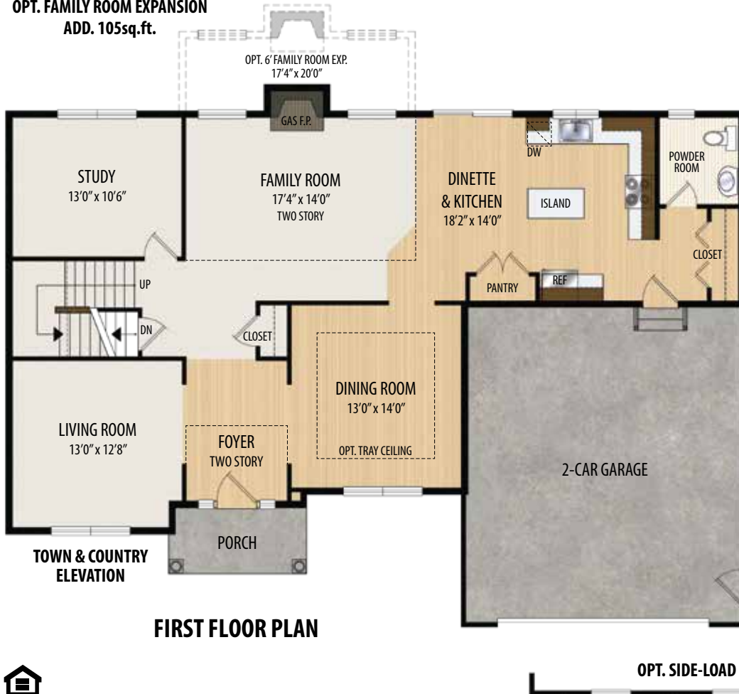
OPT. FAMILY ROOM EXPANSION ADD. 105sq.ft.