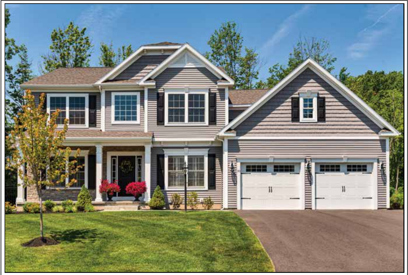
AMERICAN FARMHOUSE elevation shown with optional cultured stone.