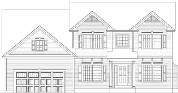
TOWN & COUNTRY