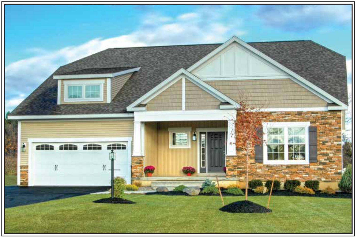
AMERICAN CRAFTSMAN elevation shown with optional cultured stone.