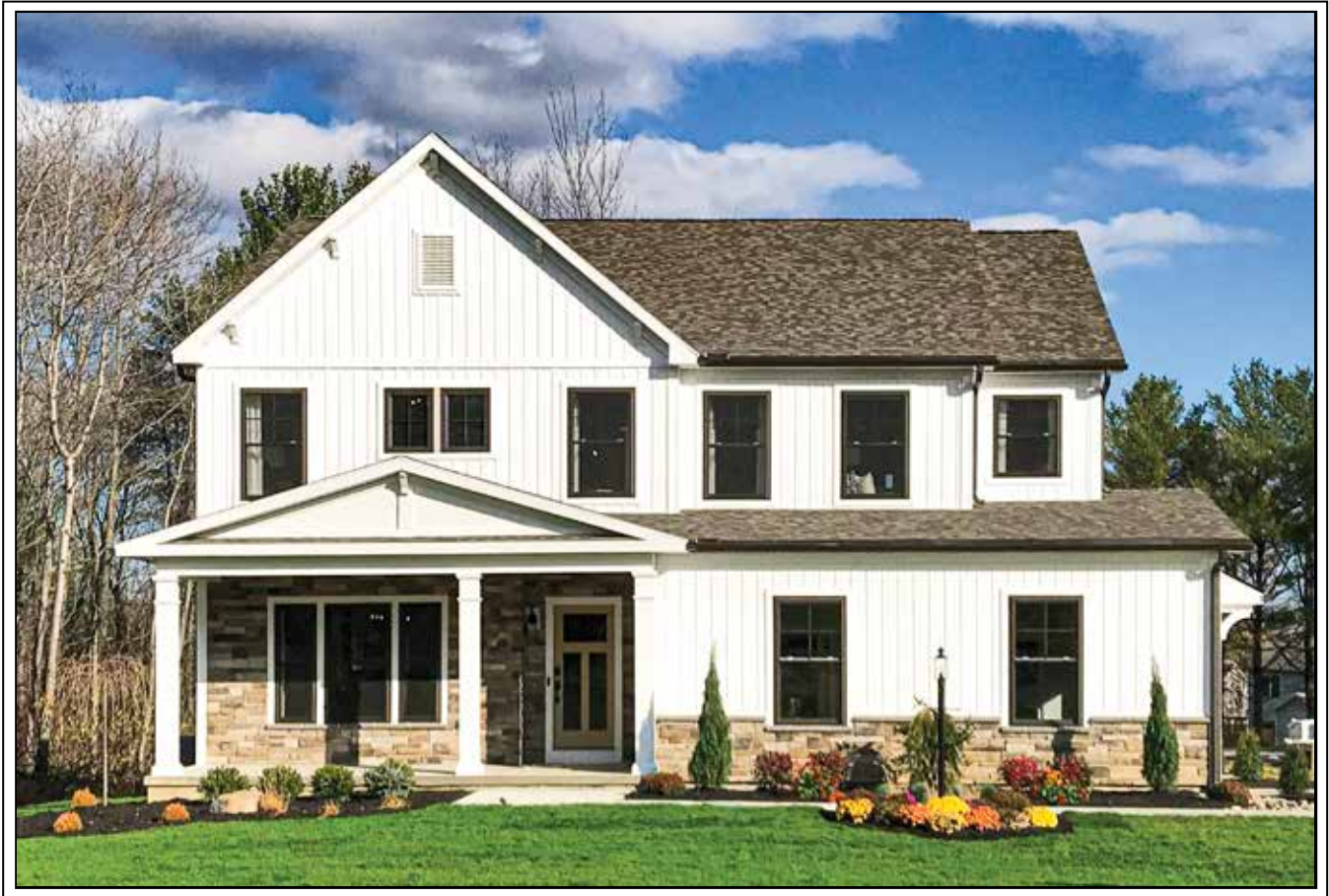
AMERICAN CRAFTSMAN elevation shown with opt. sideload garage, and opt. cultured stone.