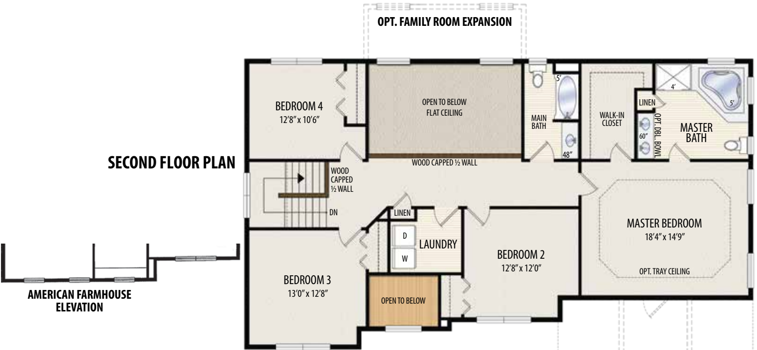
AMERICAN FARMHOUSE ELEVATION