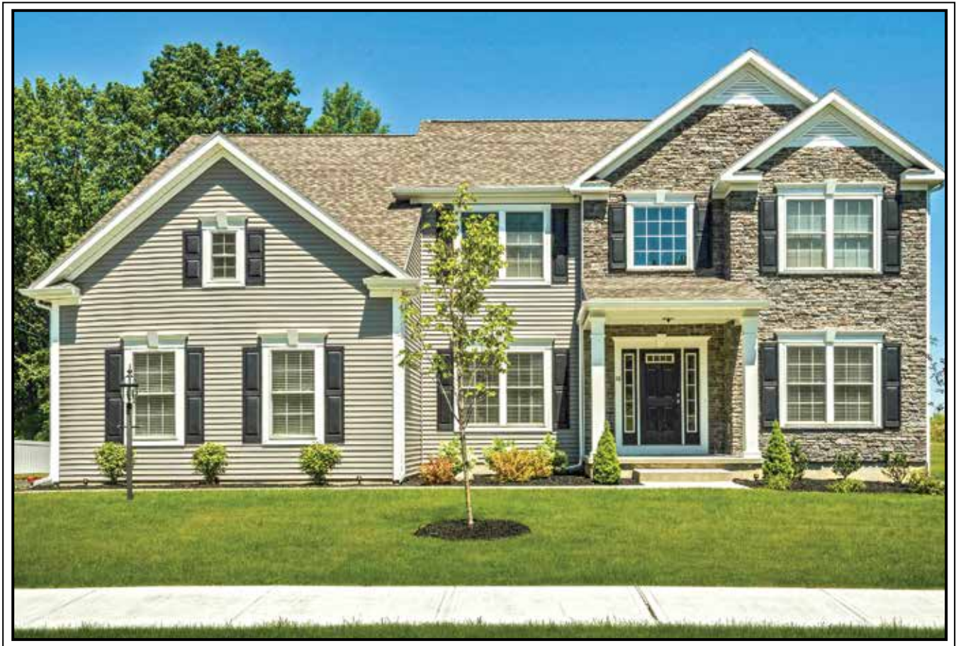
TOWN & COUNTRY elevation shown with optional cultured stone, and opt. side-load garage.