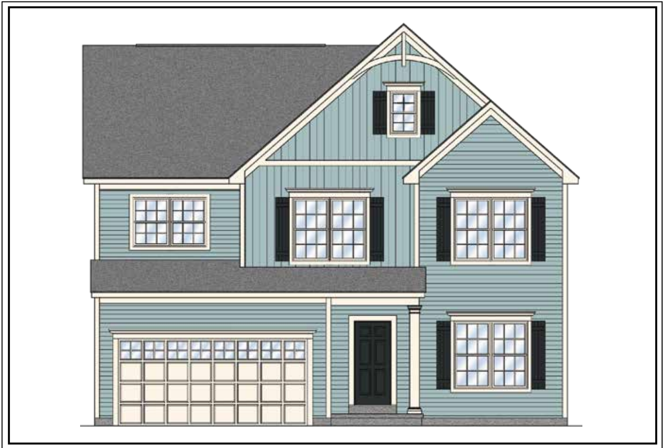
AMERICAN FARMHOUSE elevation.