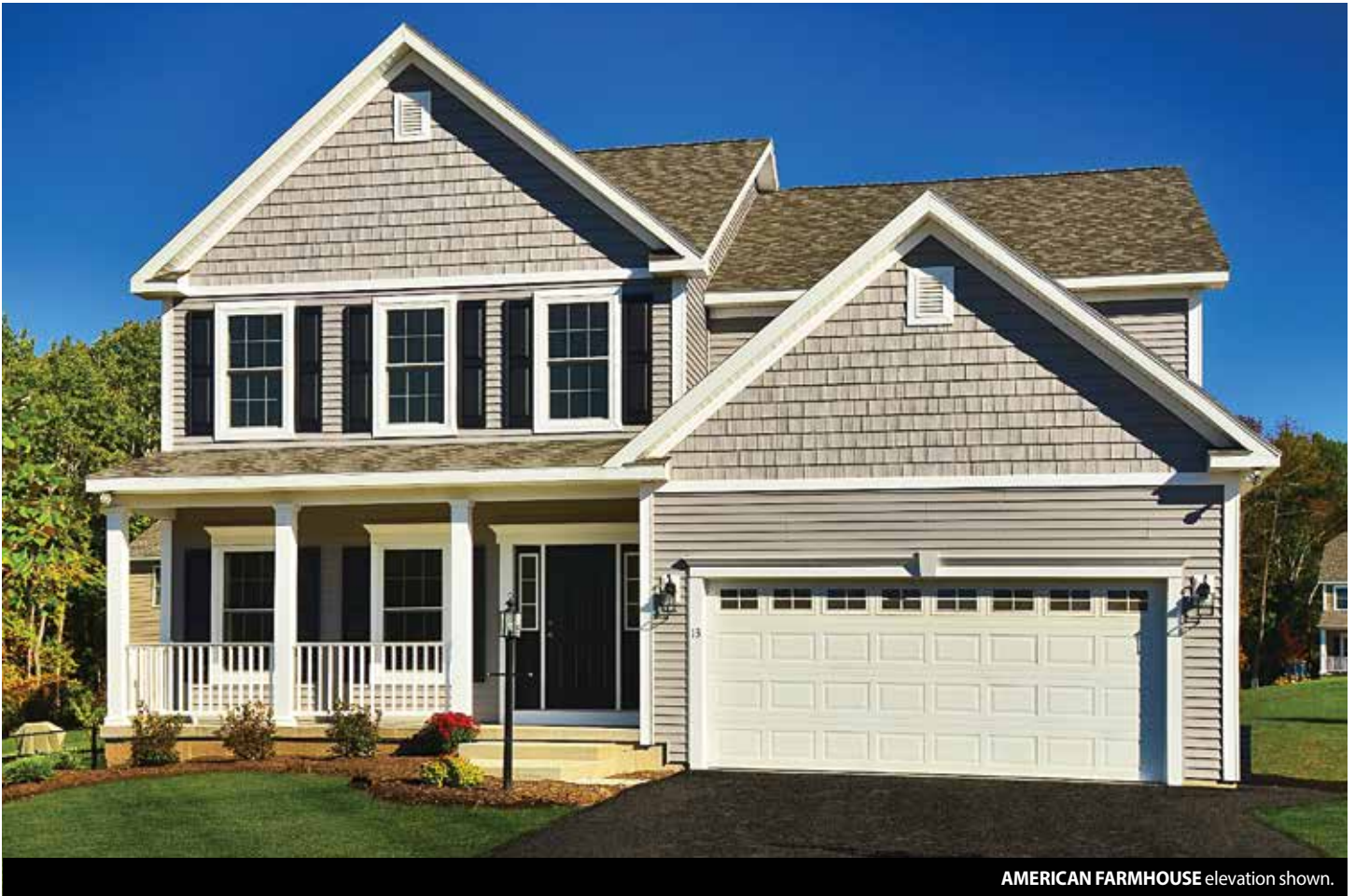
AMERICAN FARMHOUSE elevation shown.