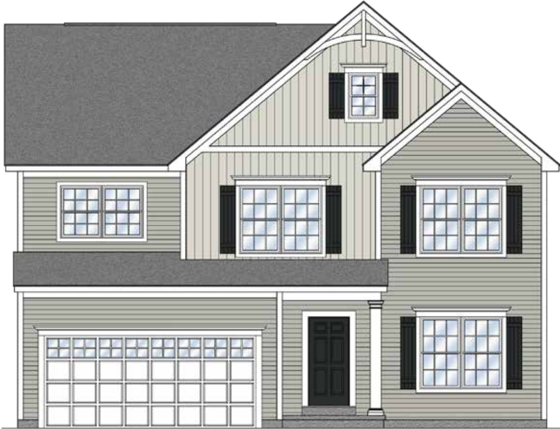
AMERICAN FARMHOUSE elevation shown.