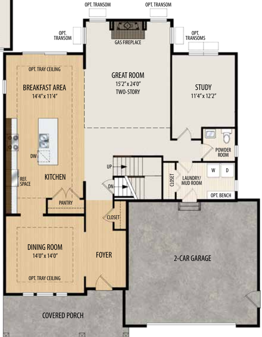
AMERICAN CRAFTSMAN ELEVATION