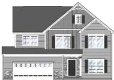
AMERICAN FARMHOUSE Estate Series show.