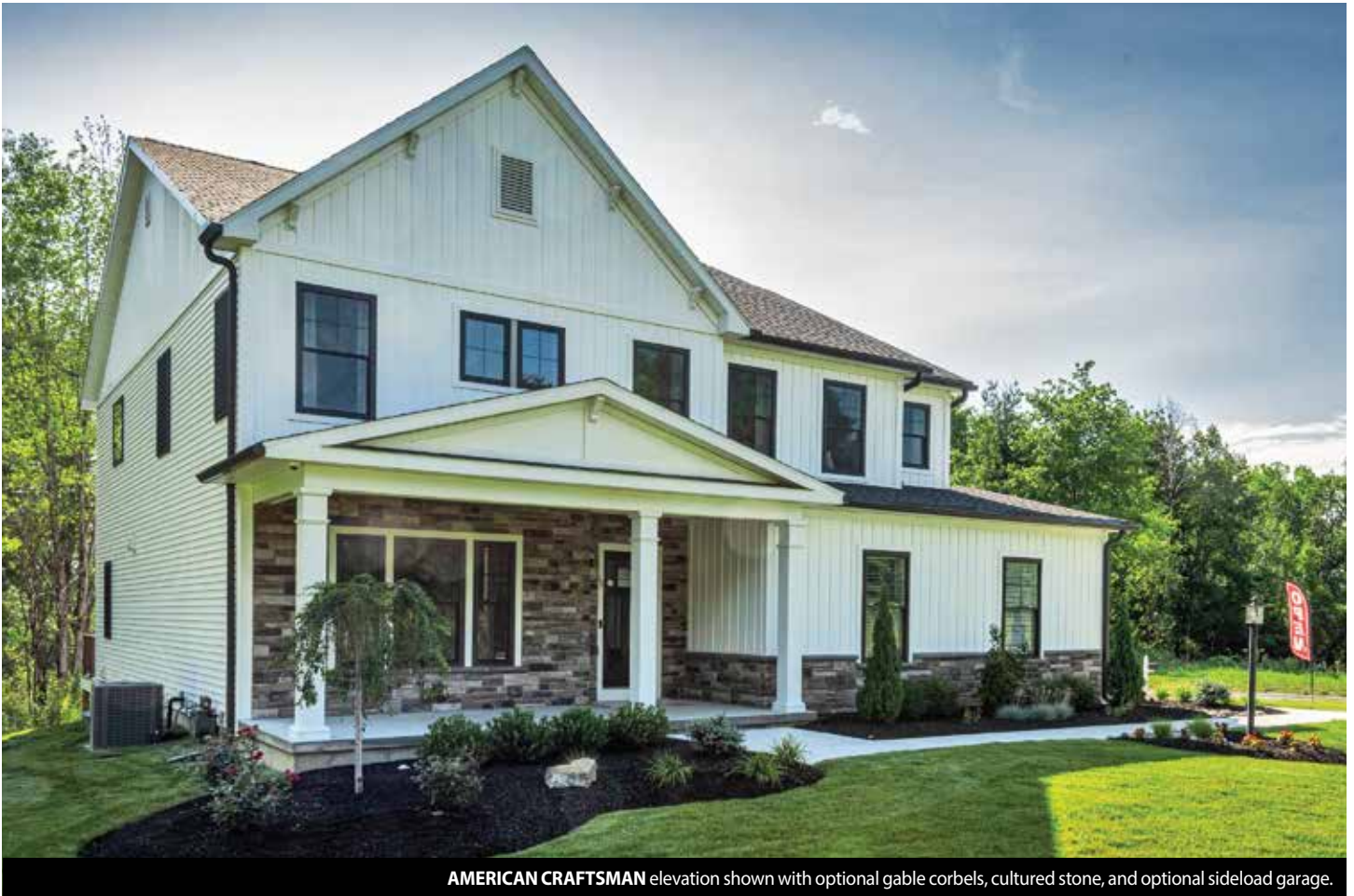
AMERICAN CRAFTSMAN elevation shown with optional gable corbels, cultured stone, and optional side-load garage.