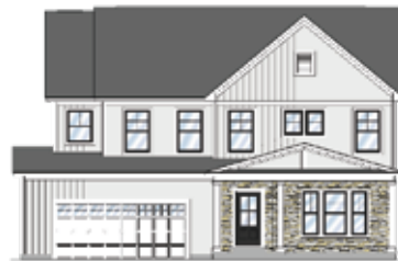
AMERICAN CRAFTSMAN Estate Series shown.