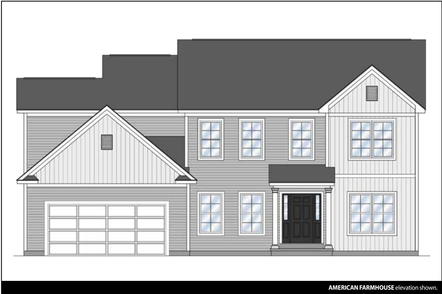
AMERICAN FARMHOUSE elevation shown.