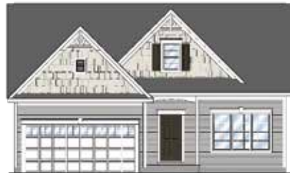
TOWN & COUNTRY