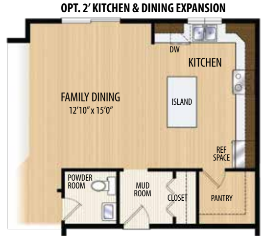
OPT. 2' KITCHEN & DINING EXPANSION