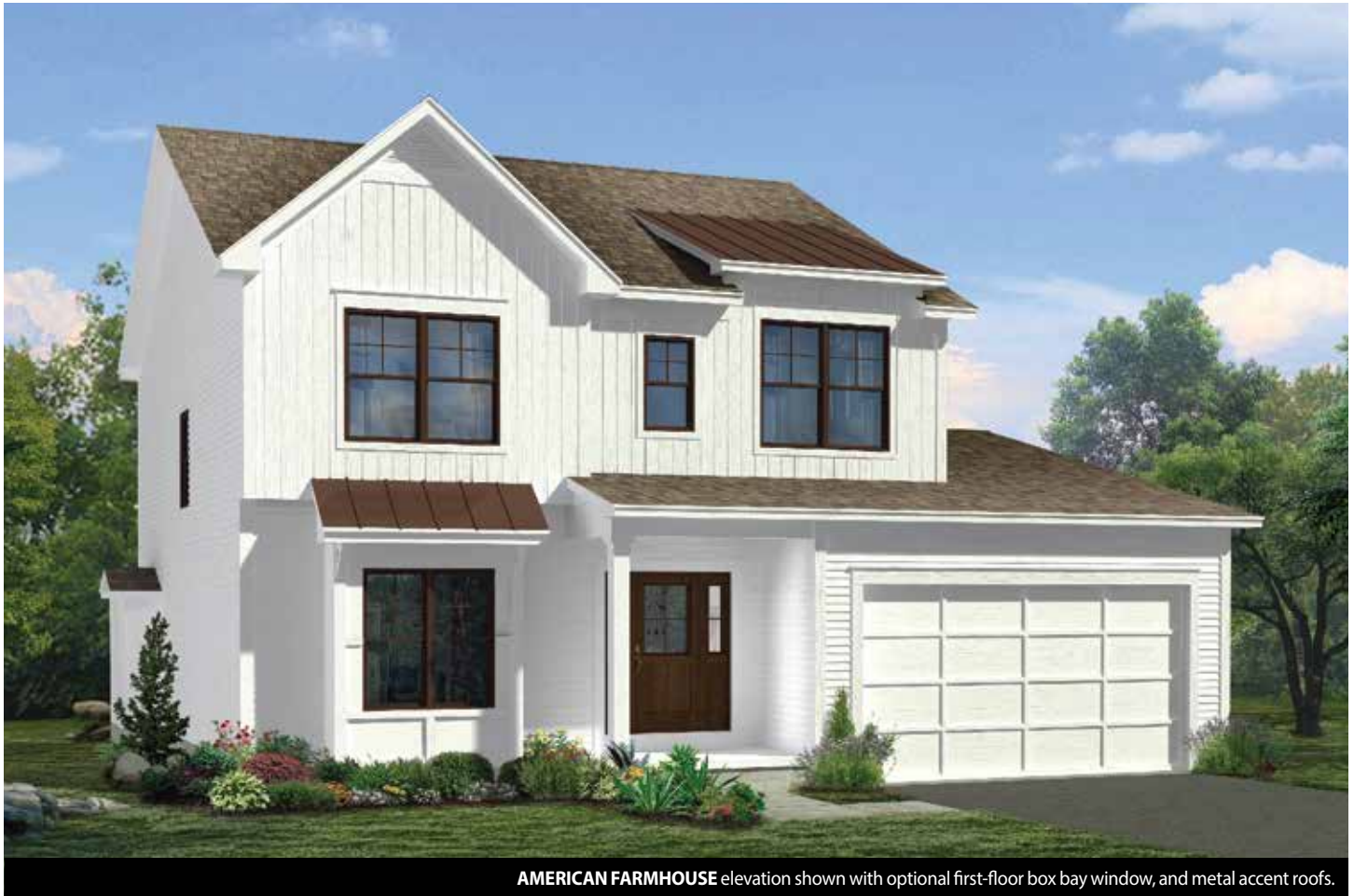
AMERICAN FARMHOUSE elevation shown with optional first-floor box bay window, and metal accent roofs.