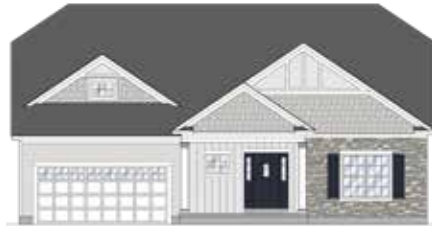
AMERICAN CRAFTSMAN Estate Series shown.