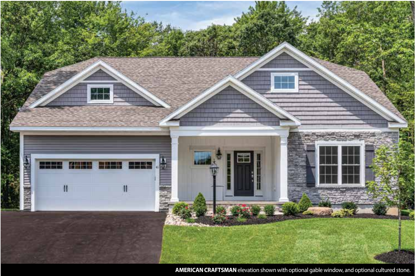
AMERICAN CRAFTSMAN elevation shown with optional gable window, and optional cultured stone.