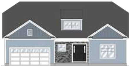
AMERICAN FARMHOUSE Estate Series shown.