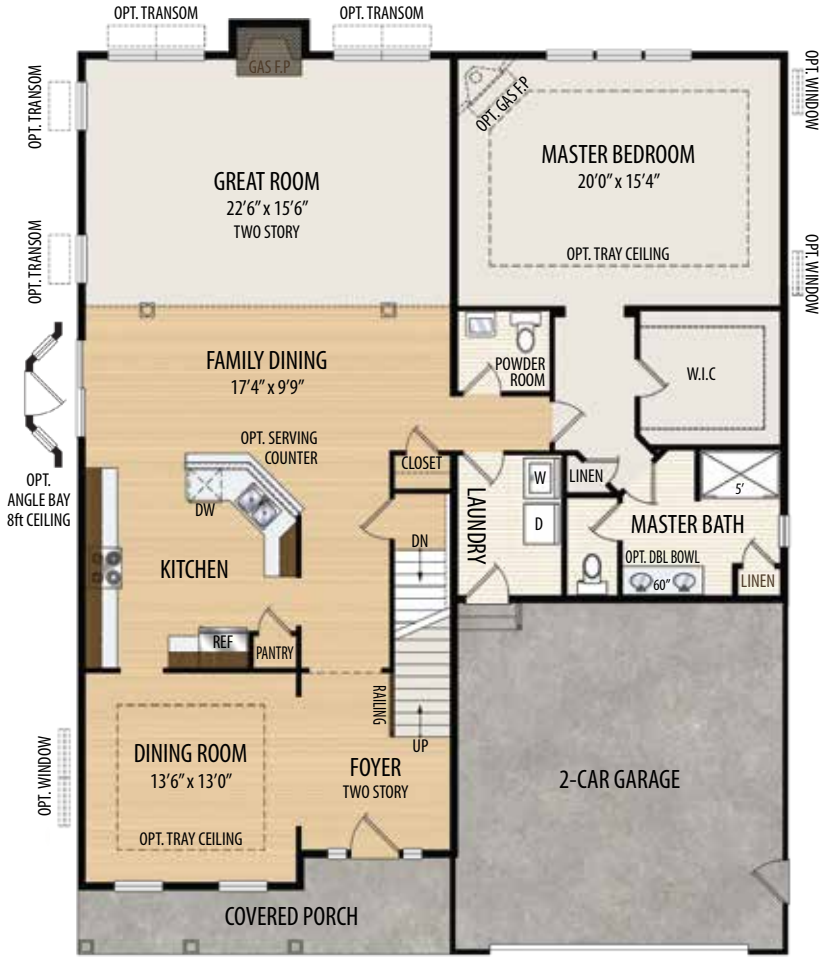
AMERICAN FARMHOUSE ELEVATION