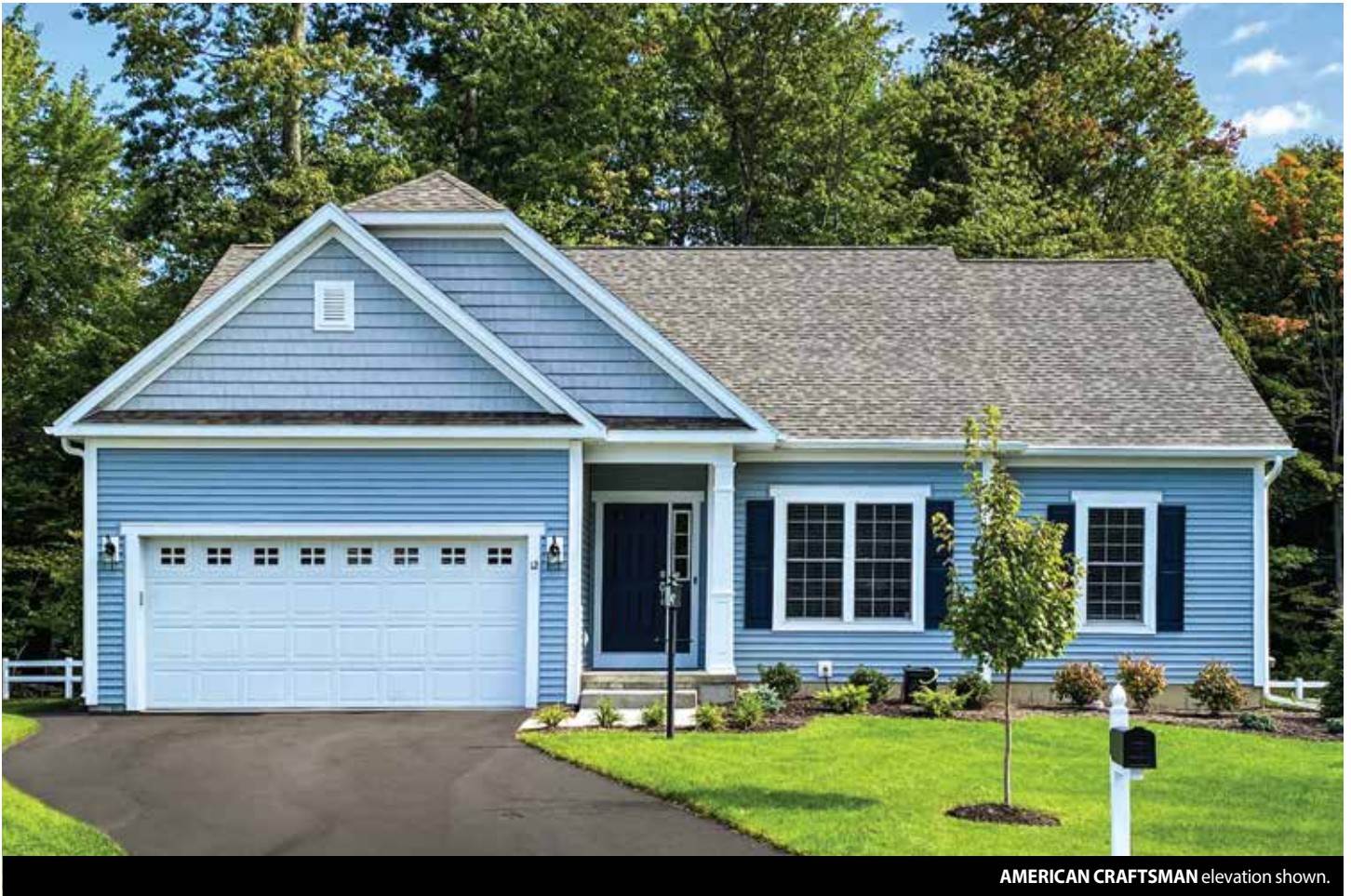
AMERICAN CRAFTSMAN elevation shown.