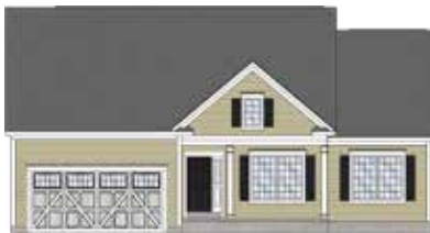
TOWN & COUNTRY