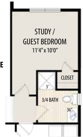
OPT. GUEST SUITE