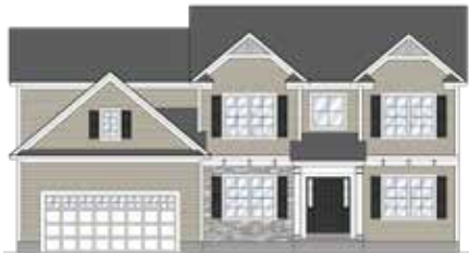
TOWN & COUNTRY Estate Series shown.