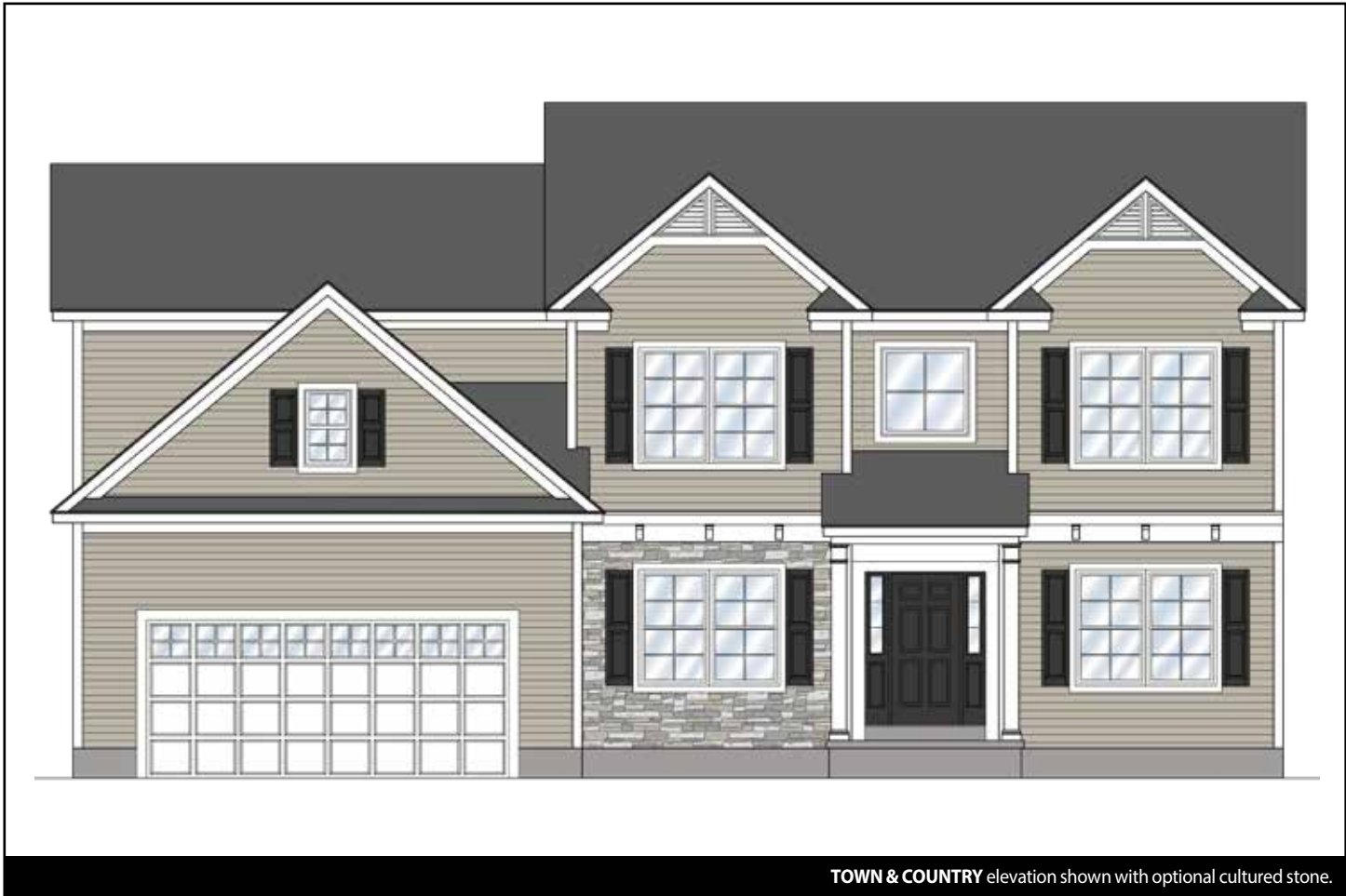
TOWN & COUNTRY elevation shown with optional cultured stone.