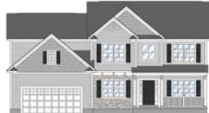
AMERICAN FARMHOUSE Estate Series shown.