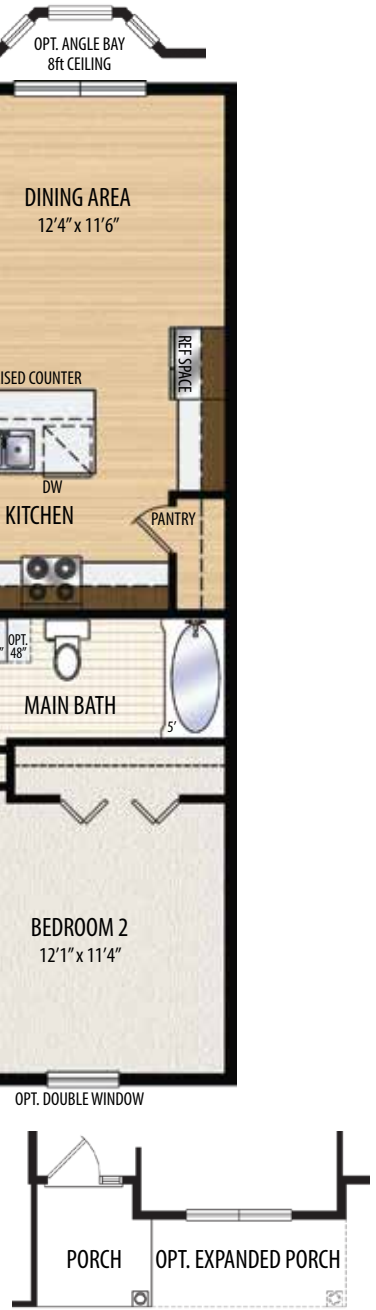
AMERICAN CRAFTSMAN ELEVATION