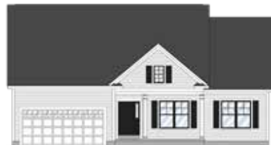
TOWN & COUNTRY