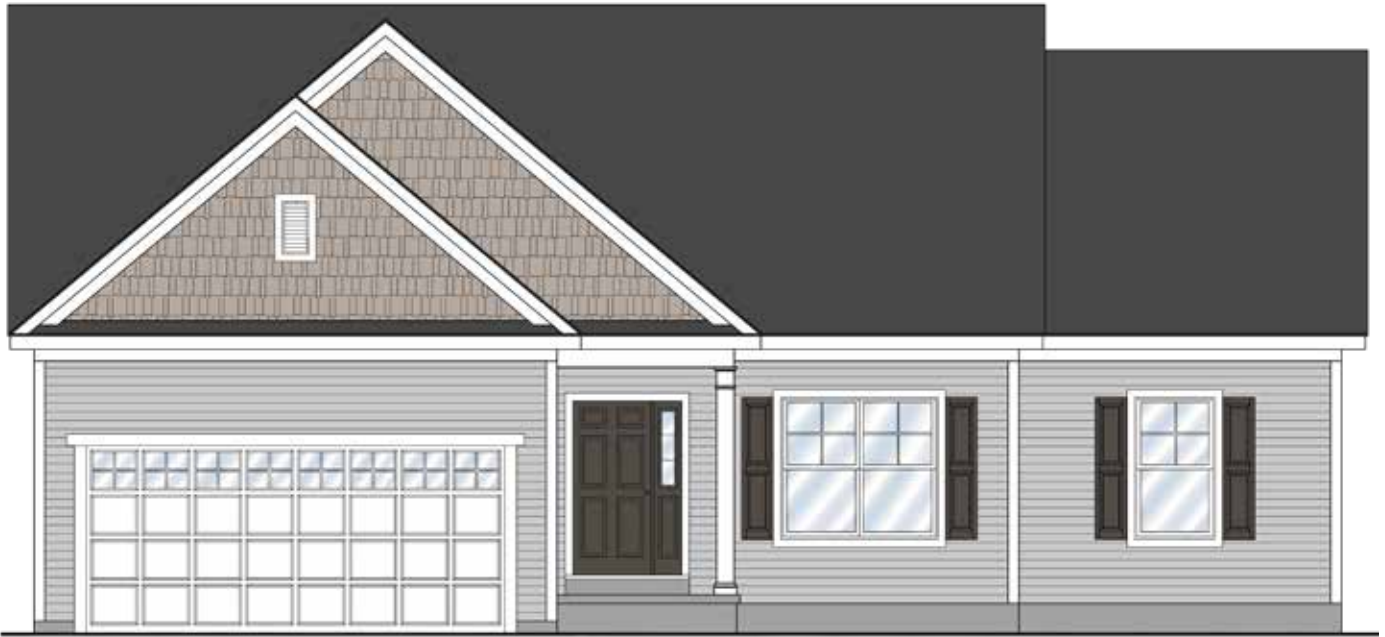
AMERICAN CRAFTSMAN elevation shown.