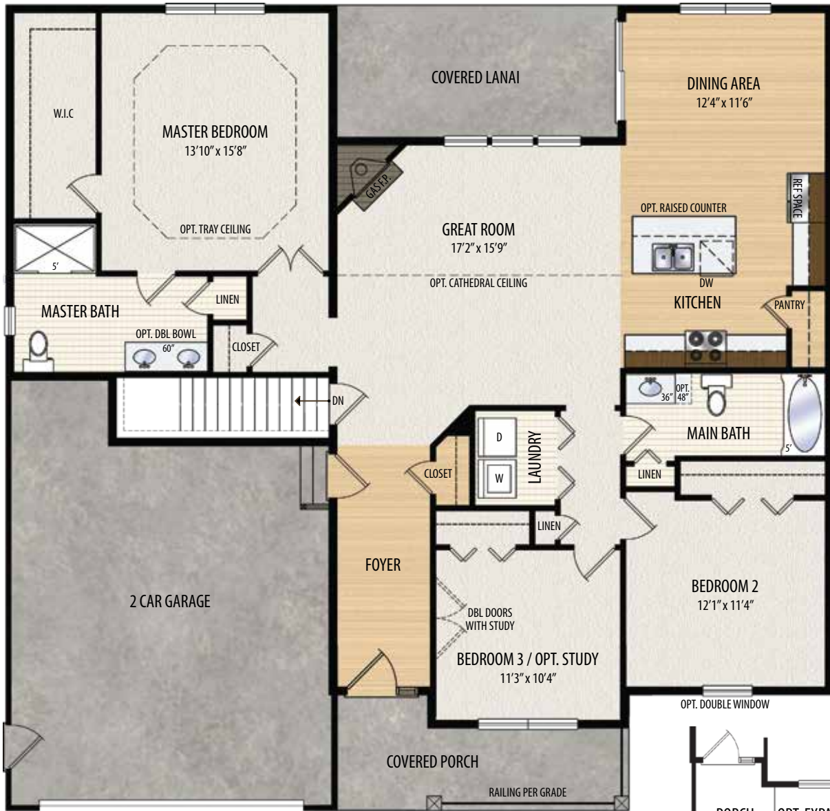
AMERICAN FARMHOUSE and TOWN & COUNTRY ELEVATION