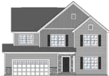
AMERICAN FARMHOUSE Shown with included cultured stone.