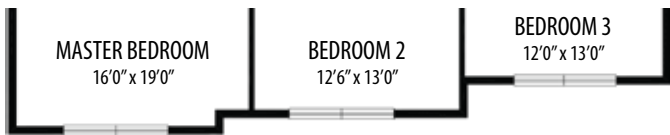
AMERICAN FARMHOUSE ELEVATION