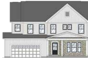
AMERICAN CRAFTSMAN Shown with included cultured stone.