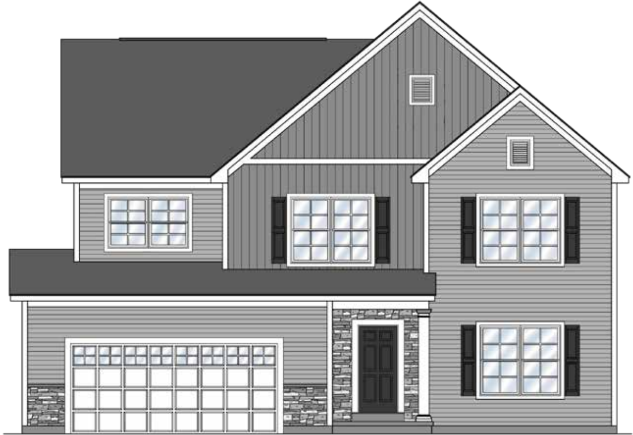
AMERICAN FARMHOUSE elevation shown with included cultured stone.