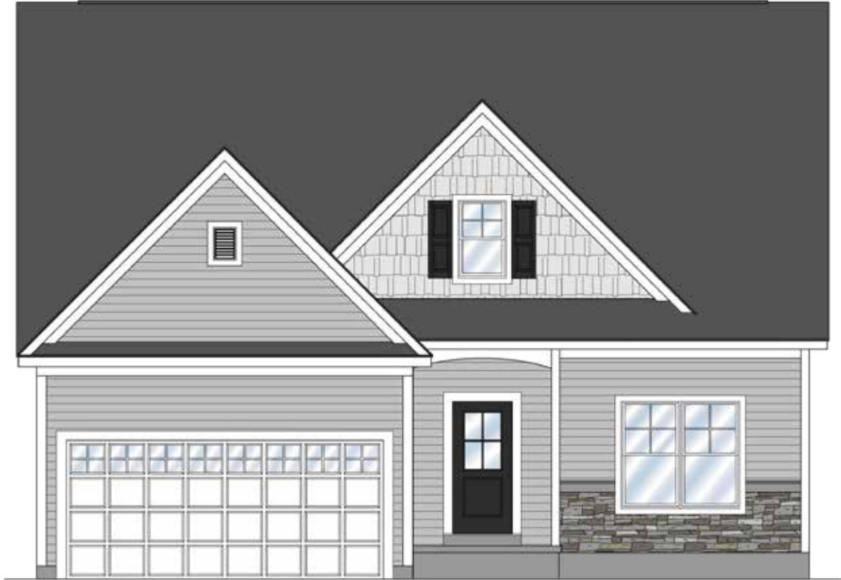
TOWN & COUNTRY elevation shown with included cultured stone.