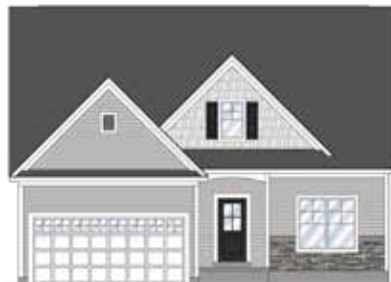
TOWN & COUNTRY Shown with included cultured stone.