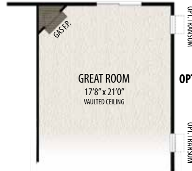
OPT. EXTENDED COVERED PORCH