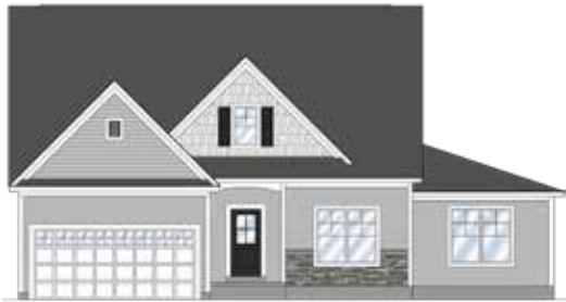
TOWN & COUNTRY Shown with included cultured stone.