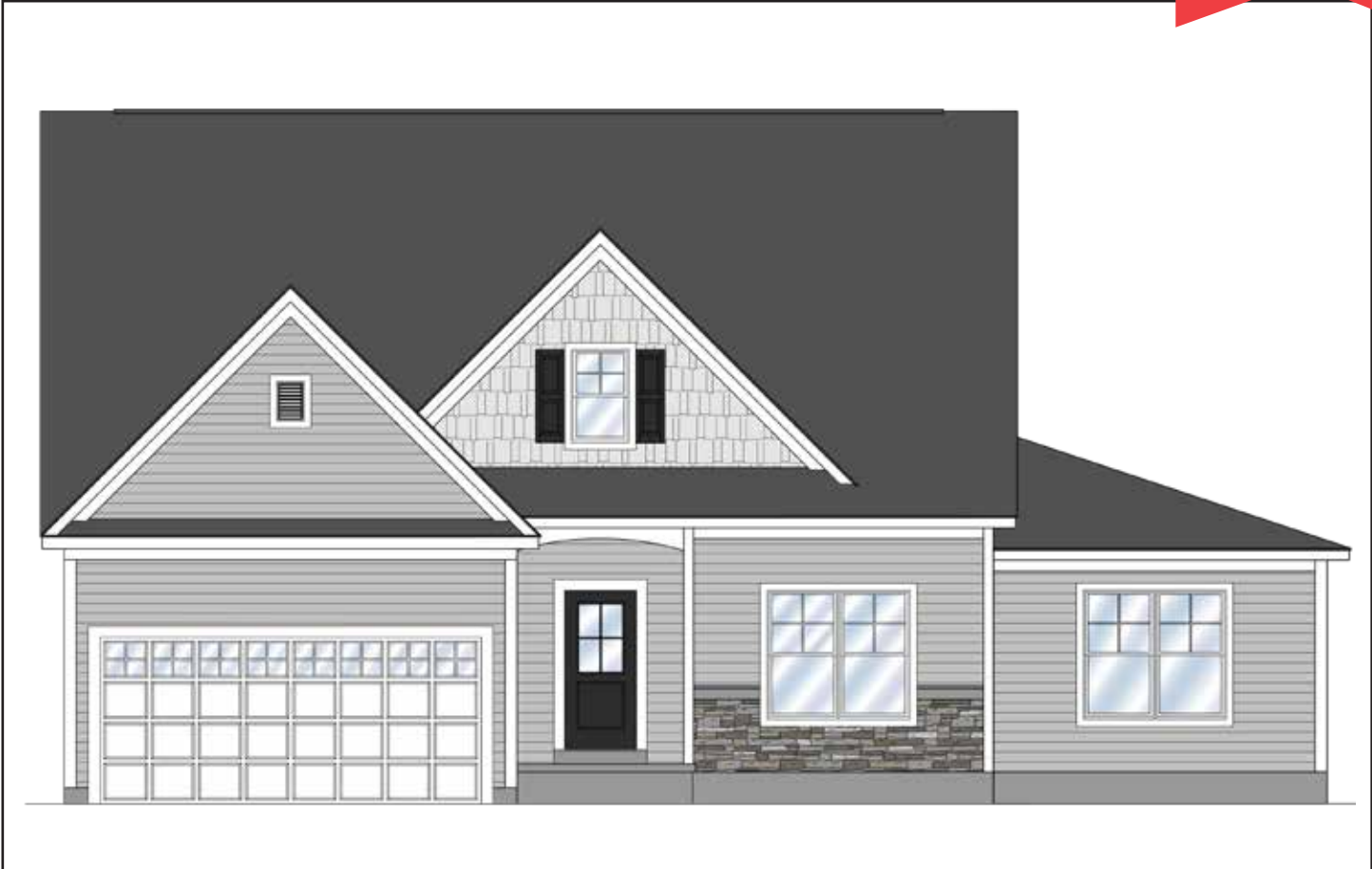
TOWN & COUNTRY elevation shown with included cultured stone, and Multi-Gen suite.