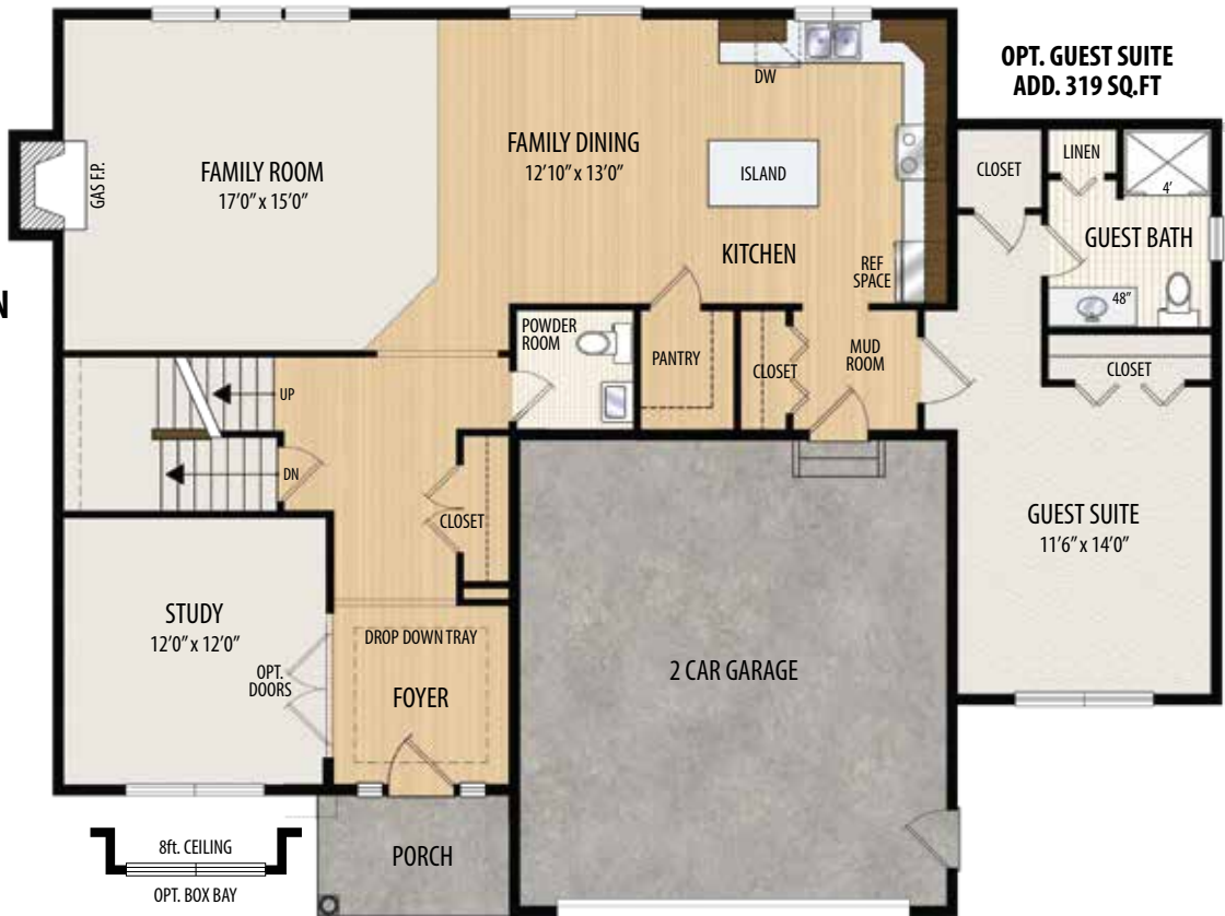
OPT. GUEST SUITE ADD. 319 SQ.FT