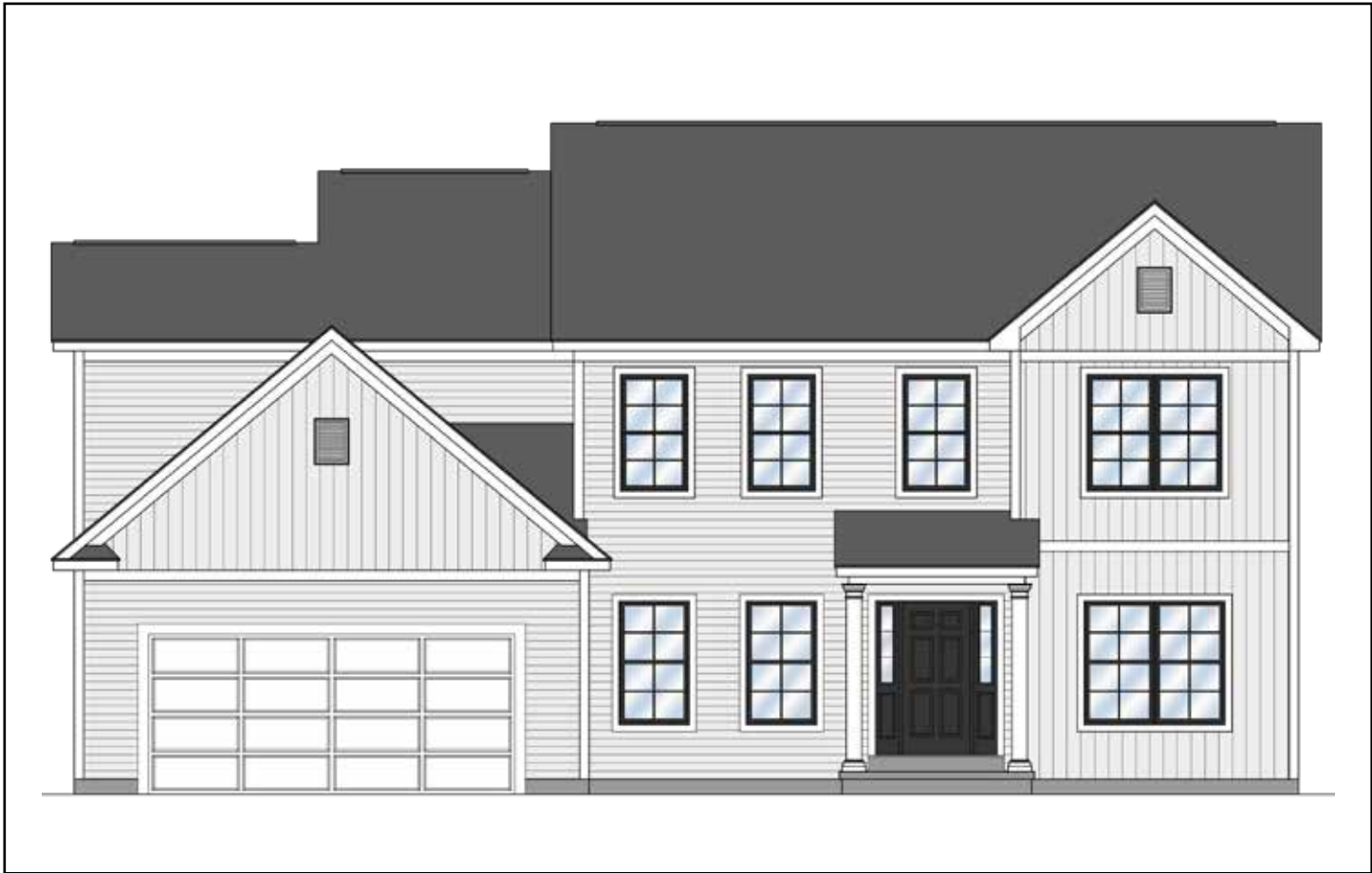
AMERICAN FARMHOUSE elevation shown with 2-story family room.