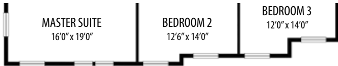
AMERICAN CRAFTSMAN ELEVATION ADD 18 sq.ft.