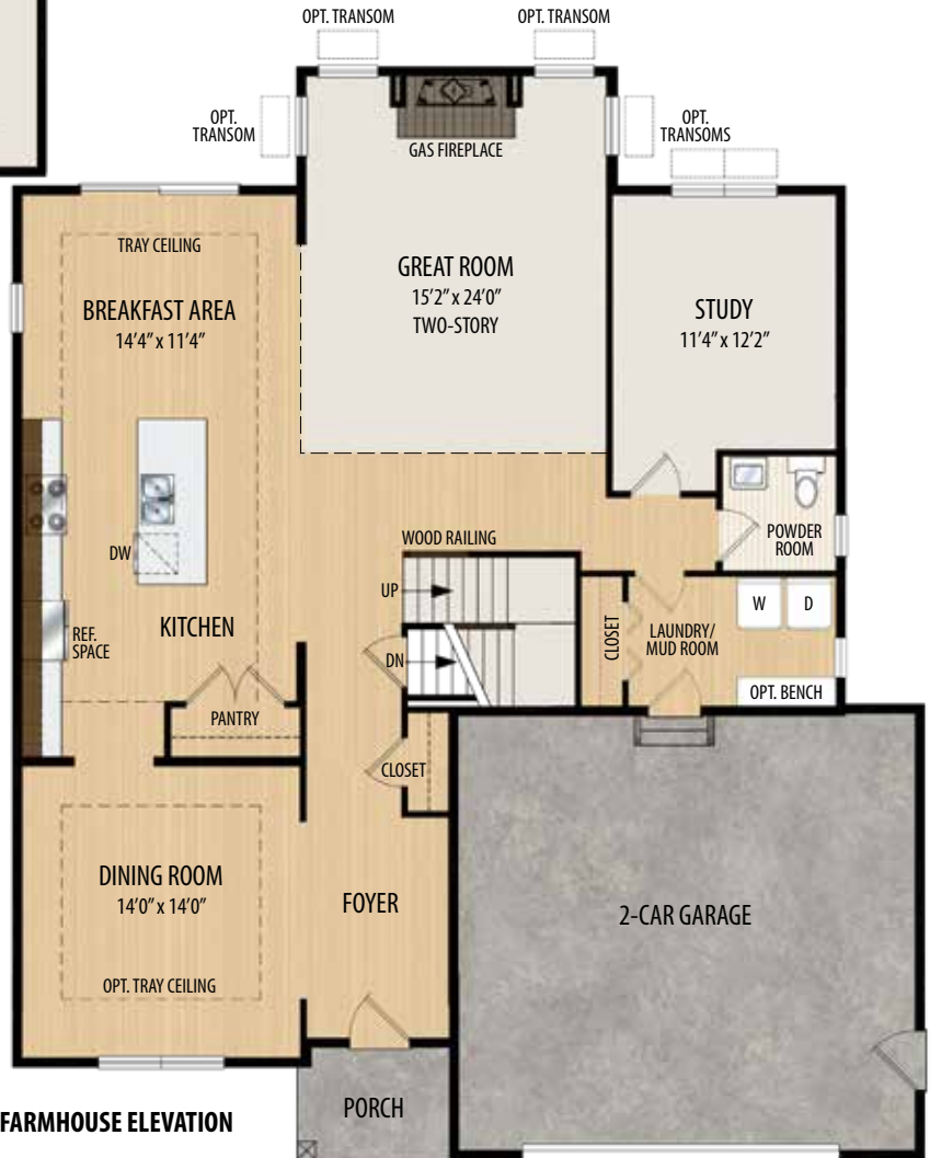
AMERICAN FARMHOUSE ELEVATION