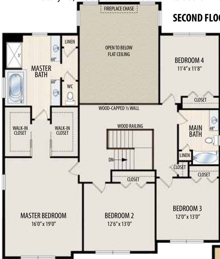
AMERICAN FARMHOUSE ELEVATION