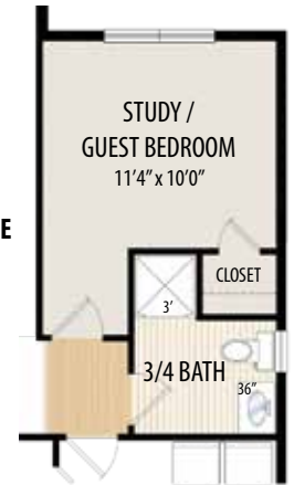
OPT. GUEST SUITE