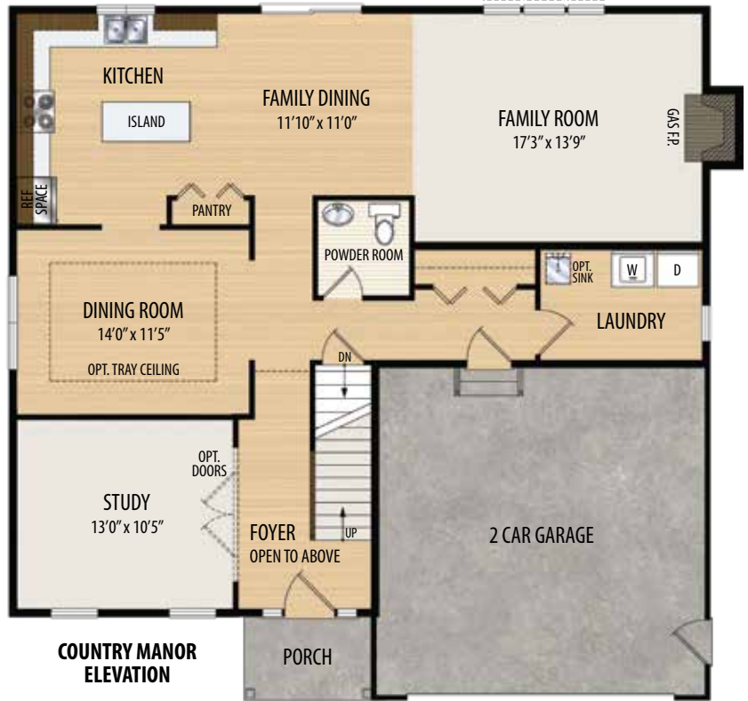
COUNTRY MANOR ELEVATION