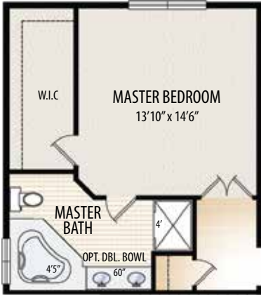
OPT. LUXURY MASTER BATH

1 Story • 1,653 sq.ft. • 3 Bedrooms • 2 Baths • Opt. Study • Covered Lanai • 2 Car Garage