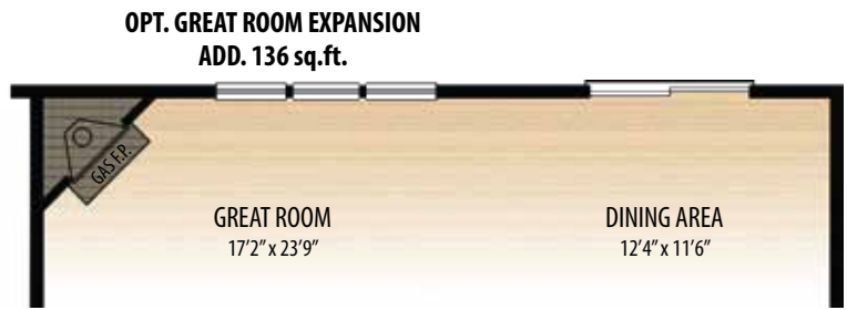
OPT. GREAT ROOM EXPANSION ADD. 136 sq.ft.