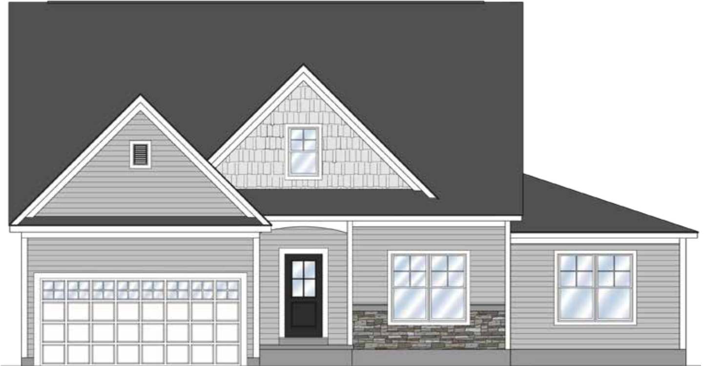
TOWN & COUNTRY elevation shown with included cultural stone.