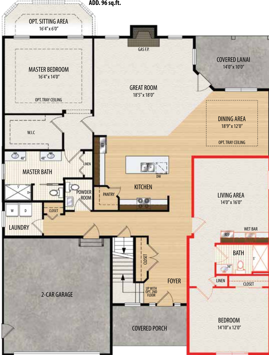
AMERICAN FARMHOUSE ELEVATION