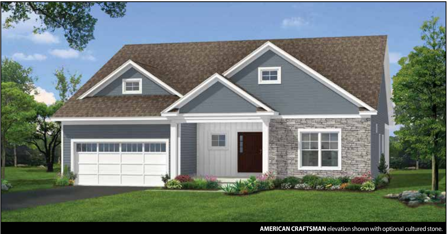
AMERICAN CRAFTSMAN elevation shown with optional cultured stone.