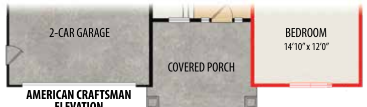
AMERICAN CRAFTSMAN ELEVATION