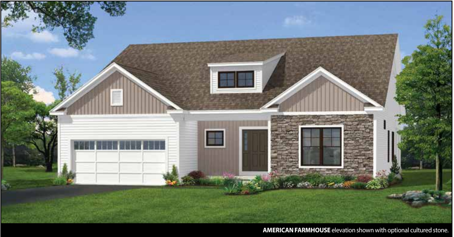
AMERICAN FARMHOUSE elevation shown with optional cultured stone.