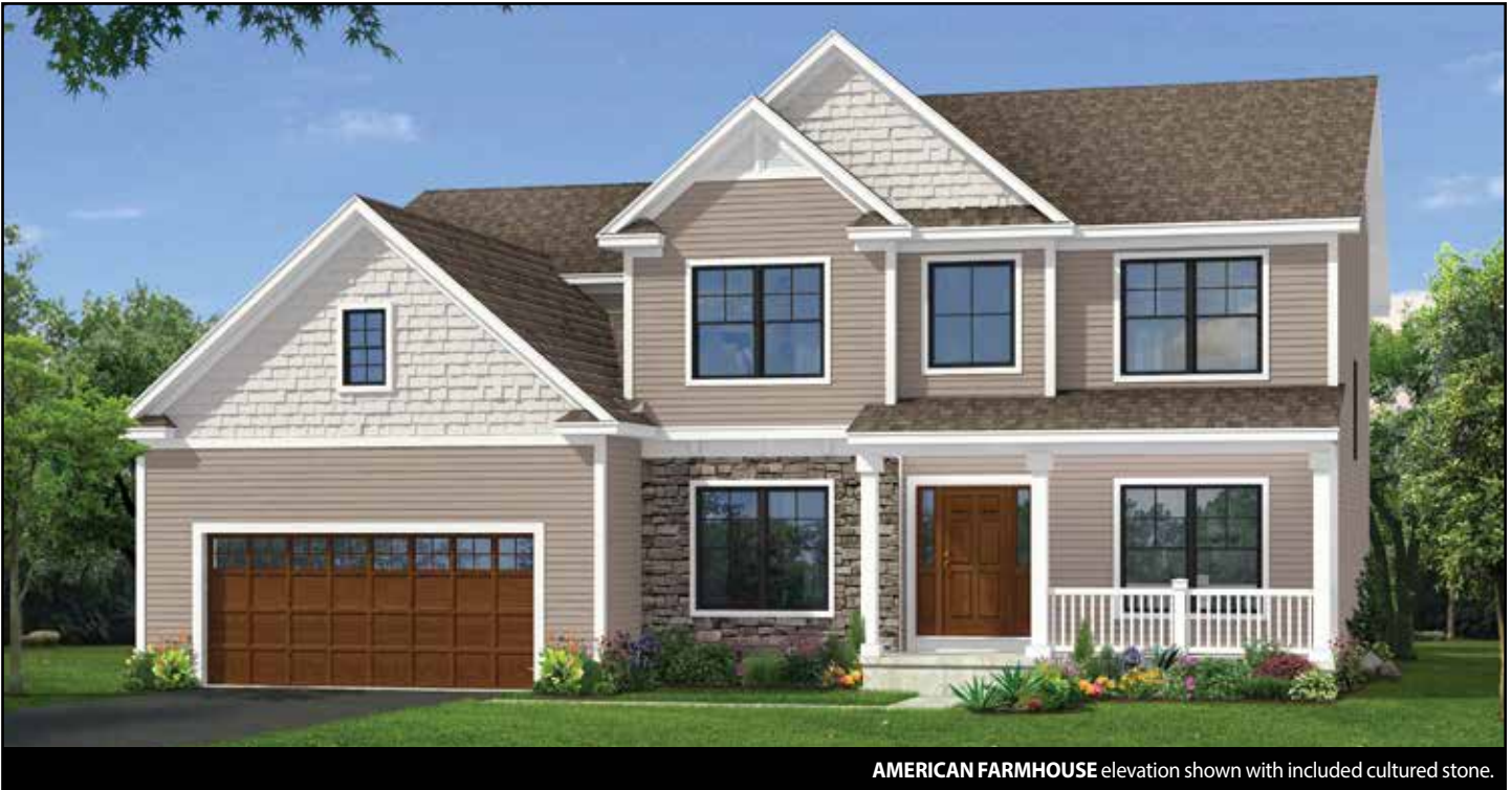
AMERICAN FARMHOUSE elevation shown with included cultured stone.