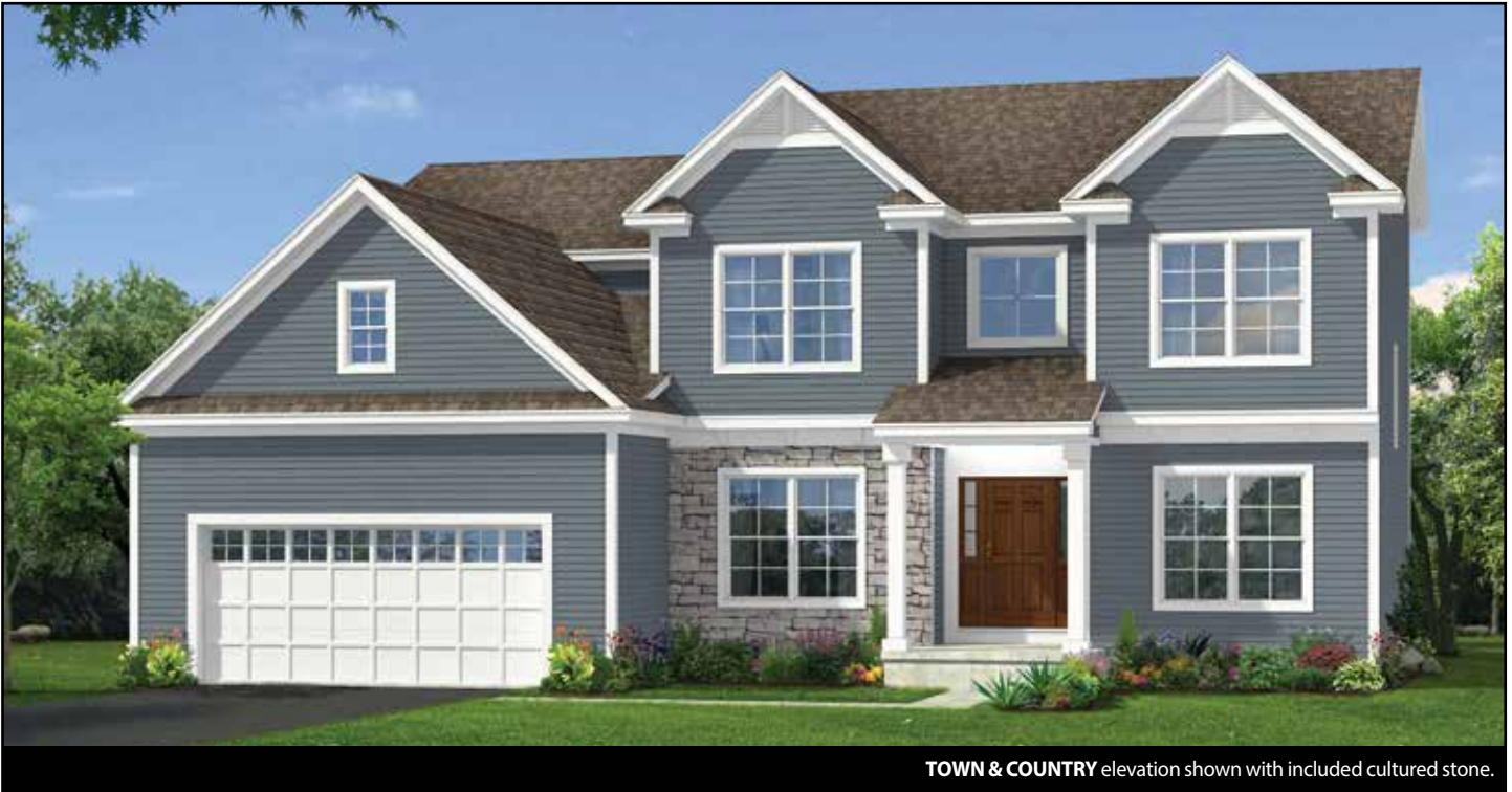
TOWN & COUNTRY elevation shown with included cultured stone.