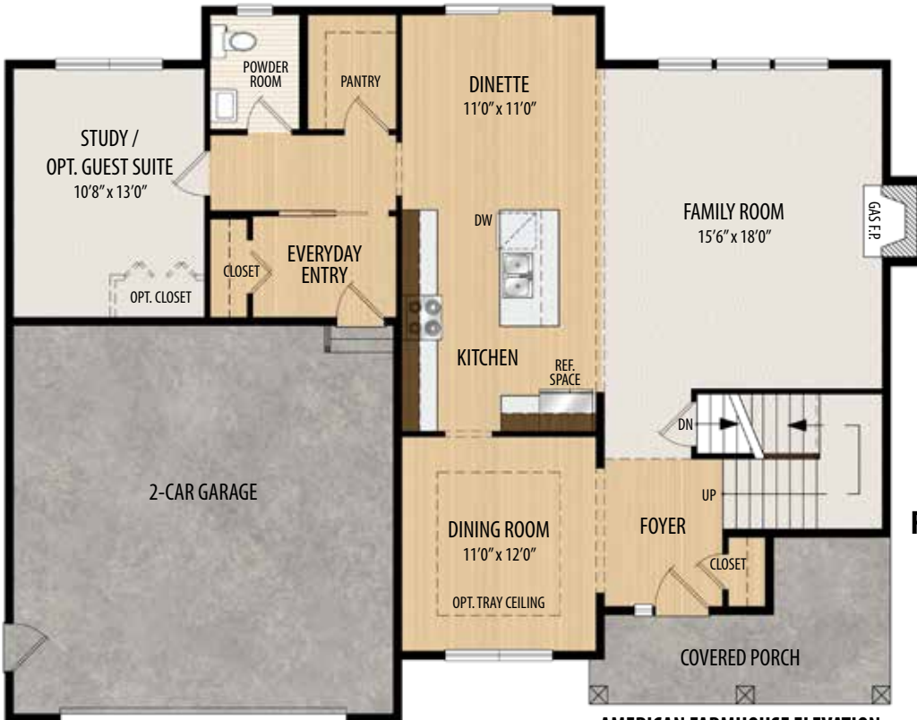
AMERICAN FARMHOUSE ELEVATION