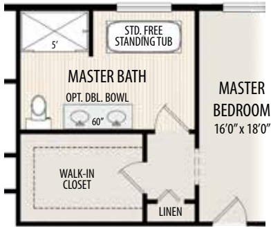
OPT. LUXURY MASTER BATH

2 Story • 2,799 sq.ft. • 4 Bedrooms (Opt. 5) • 2.5 Baths (Opt. 3) • Dining Room • Study • 2 Car Garage