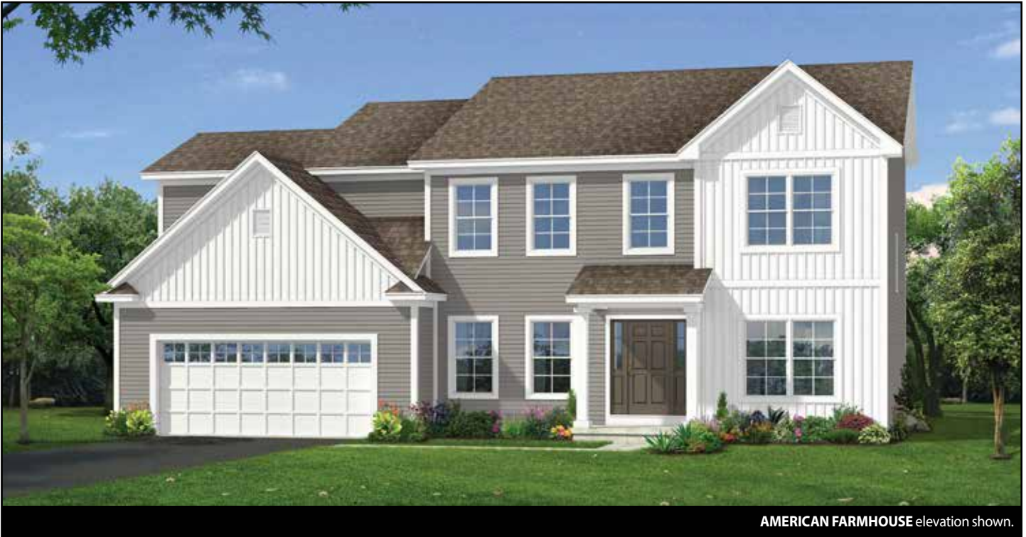
AMERICAN FARMHOUSE elevation shown.