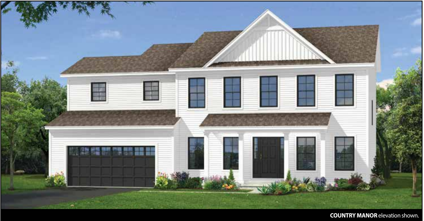
COUNTRY MANOR elevation shown.